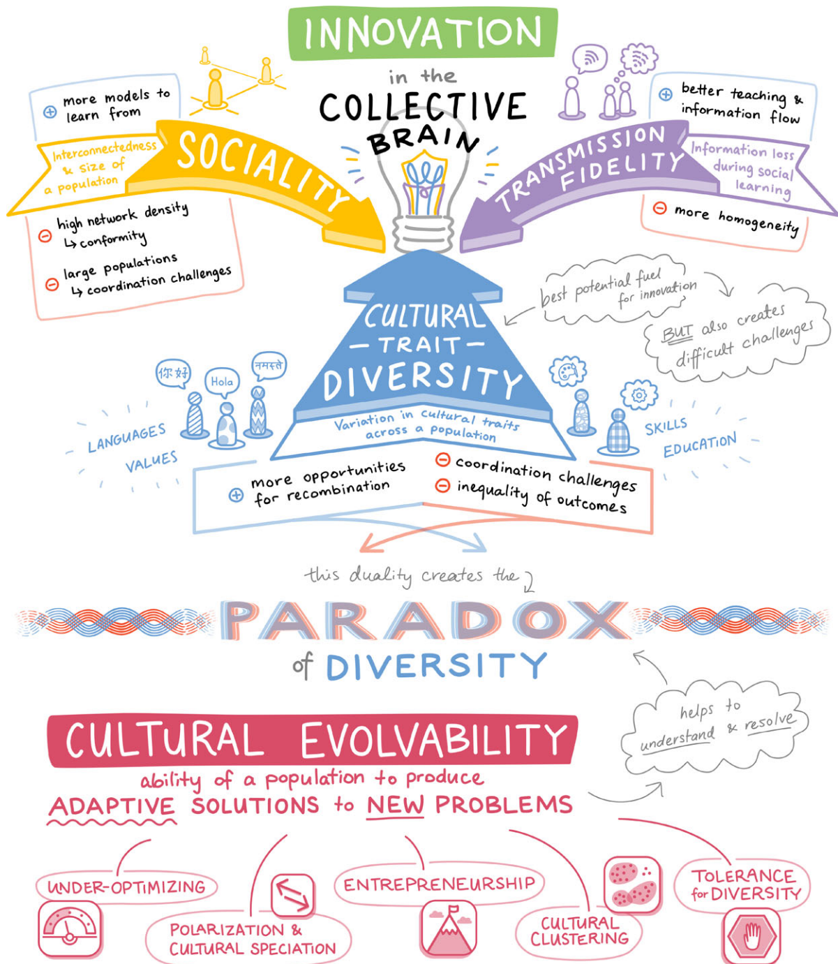
Figure 1. Innovation in the collective brain is influenced by three levers: sociality, transmission fidelity and cultural trait diversity. All three levers can increase and harm innovation. Cultural trait diversity offers the most potential, but also a difficult challenge. This duality of cultural trait diversity creates the paradox of diversity. We introduce cultural evolvability as a means to better understand and resolve the paradox of diversity. (Online version in colour.)

interests, arguing that cooperation with unrelated individuals can decrease the cost–benefit ratio of learning more complex technologies and social norms. Cultural evolution continues to increase transmission fidelity in our increasingly culturally complex modern world, through technologies such as the printing press, radio, television, Internet, video conferencing and social media.