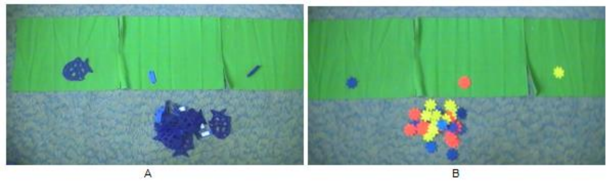
Image 3: Set-up for the "Classification of shapes" (A) and "Classification of colors" (B) subtests. Three tests make it possible to measure the visual gnosias. They are made up of objects (those in the first category) and three kinds of images, representing the same 12 objects.

The evaluator also places a flower of each color onto the carpet and shows the subject how to match the flowers by color (Image 3B). Same as for the shapes, the subject continues on to complete the task alone.