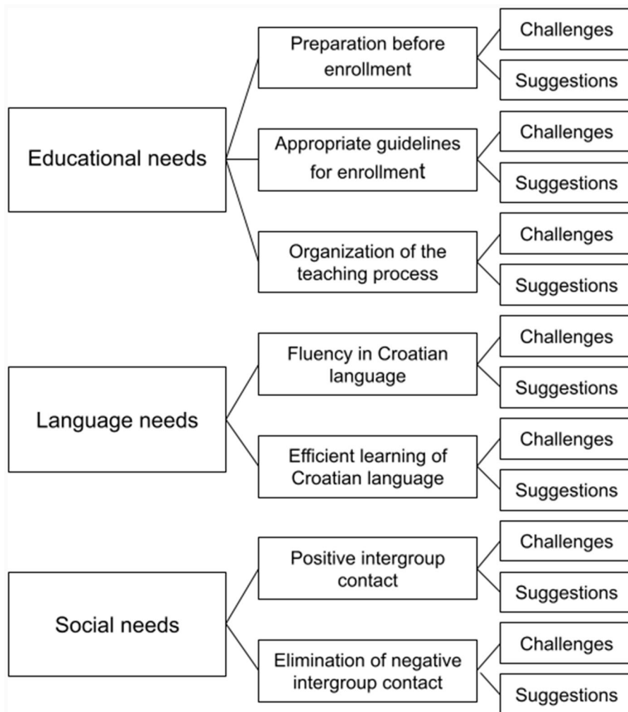
Figure 1. Illustration of the results of thematic analysis.