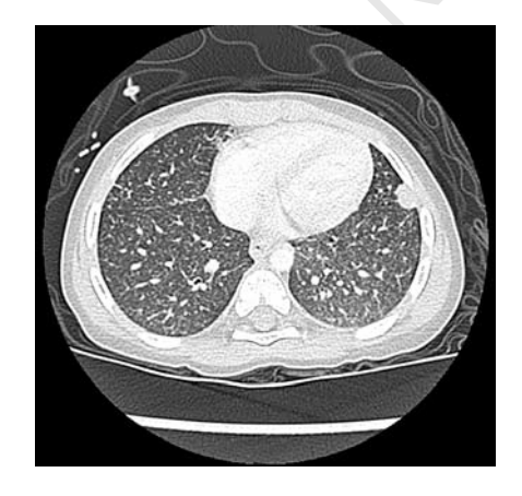
Figure 2. Thoracic computed tomographyscan: diffuse bilateral micronodular infiltrate; one nodular lesion (diameter: 1 cm).