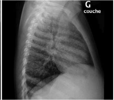
Figure 1. Full-face chest X-ray: bilateral micronodular parenchymal lesions. Profile: diffuse micronodular opacity including anterior mediastinum.