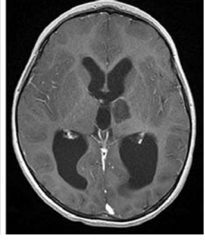
Figure 3. Left Panel) multiple contrast-enhanced nodular lesions of the whole encephalus on T1 sequence cerebral magnetic resonance imaging (MRI). Central Panel) Cerebral computed tomography-scan demonstrating enhancing hydrocephalus and hypodense lesion of left thalamic region two days later. Right Panel) Evolution after 7 weeks of antituberculous and steroids therapy: disappearance of nodular lesions, persistence of hydrocephalus and thalamic ischemic lesion on T1-weighted + gadolinium MRI.