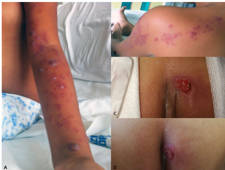
FIGURE 1 VZV reactivation (A, B) and vulvar ulcers (C, D) of the patient.

Normality of Fas-mediated apoptosis and the lack of diagnostic criteria ruled out an autoimmune lymphoproliferative syndrome (ALPS). Mild hypogammaglobulinemia prior to initiation of IVIG therapy was noted. The humoral