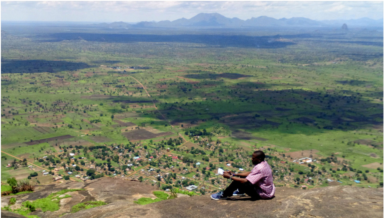
The Agoro-Agu Landscape

Forest Management Plan (Republic of Uganda, 2019). The three main land use types in the Agoro-Agu Sector are small-scale cultivation (37.5 per cent), grassland (12.5 per cent) and woodland (43.8 per cent).