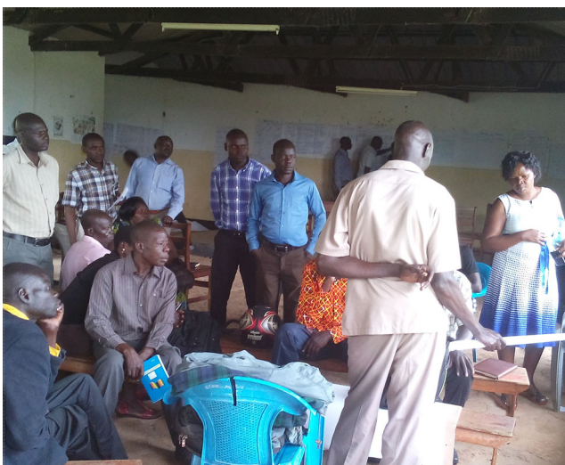
Consultations and participatory planning with Sub-county level Technical Staff and Political Leaders

With stakeholders, we tried to establish what the future of the landscape should look like and identify what needed to change to achieve that vision. At the District Local Government level, stakeholder engagement and dialogues were conducted for each district. The identification of participants was done in collaboration with District Local Government officials and members of the Core Planning Team. At the sub-county level (also known as Lower Local Government), consultations involved parish chiefs, cultural leaders and CSO