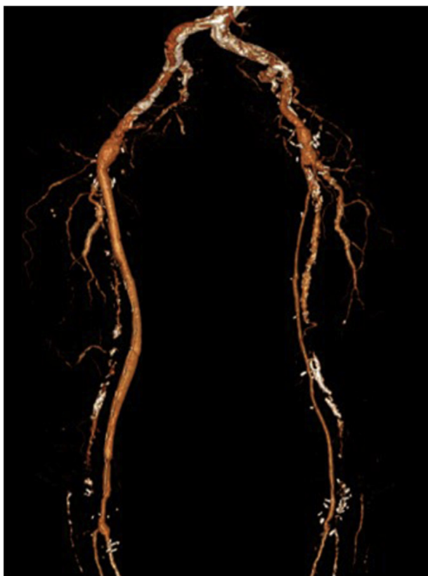
Figure 2. Three dimensional computed tomography angiography scan showing a patent right femorotibioperoneal trunk self made porcine pericardial tube bypass one month post-operatively.

Although this technique seems to have some important advantages, it also raises some concerns, especially regarding haemostasis and costs. Indeed, some form of oozing in some parts of the stapler lines was observed after proximal declamping. It stopped quickly, but when it continued to ooze, around five extra stitches were needed to ensure complete haemostasis. Once complete haemostasis was achieved, the graft was tunnelled into the anatomical position through a "tunneller", which consisted