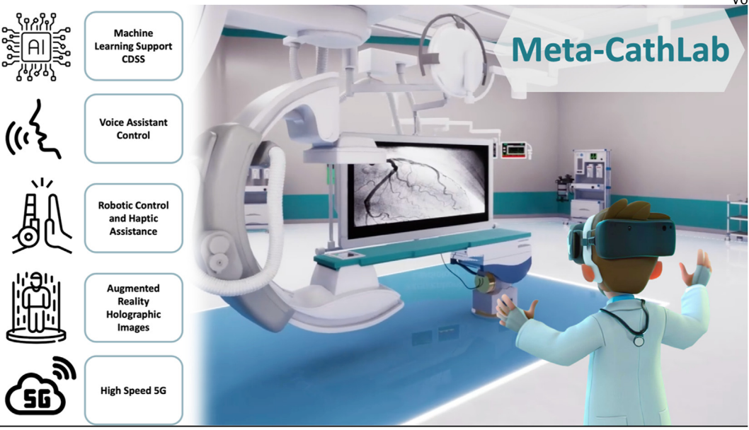
Figure 1. The Meta-CathLab and its key components. CDSS, clinical decision support system.

to replicate tactile sensations, allowing interventionalists to experience the sensation of handling instruments in a virtual environment. This tactile feedback is crucial in interventional cardiology, where the sense of touch plays a vital role in making precise and delicate manoeuvres during procedures.