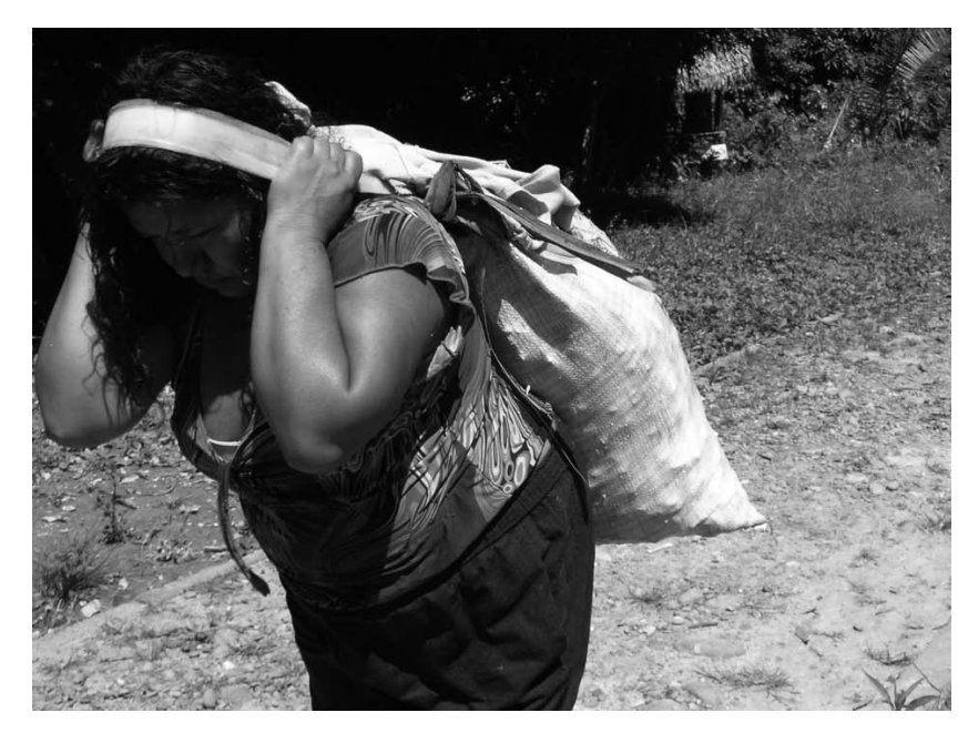
Fig. 3 A Yine woman from the Comunidad Nativa de Diamante, a beneficiary of the Amarakaeri Communal Reserve. She is carrying a bag of yucca to feed the family.