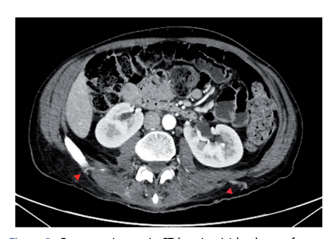
Figure 2. Pre operative angio-CT locating L4 lumbar perforators (red arrows).

subcutaneous tissue and effectively covering the exposed dura mater with the thick lumbar fascia. Wounds were closed in layers over Blake suction drains (Ethicon, Johnson and Johnson, Sommerville, New Jersey, USA; Aesthesio, DanMic Global, San Jose, California, USA). A peroperative venous congestion required skin secondary closure at 6 d (Figure 3D). Flaps were monitored by Doppler ultrasound and clinical evaluation by the nurse every 2 h. Wound healing was uneventful (Figure 3E and F). Selective antibiotic iv therapy was administered according to bone microbiology (Escherichia Coli and Enterococcus faecalis osteomyelitis). The patient showed no complications at one-year followup with return to daily activities. Semmes-Weinstein sensation test (Aesthesio, DanMic Global MMC) at one year showed protective sensation with monofilament test ranging from 2 to 4 g (4.31–4.36 monofilaments size) in all reconstructive areas, indicating good to moderate protective sensibility.[5,6]