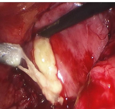
Ultrasound (A) and laparoscopic (B) pictures showing the tubo-ovarian abscess and its caseous content. 183x84mm~(300~x~300~DPI)