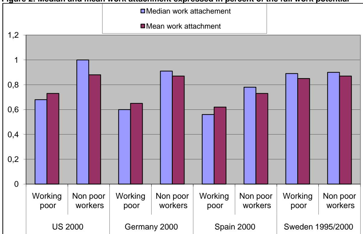
Figure 2: Median and mean work attachment expressed in percent of the full work potential