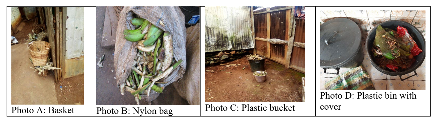
Figure 4: Types of dustbins used in households and restaurants

Second, no social norms or intrinsic environmental or cultural values are associated with waste segregation in Dschang. Qualitative responses of the survey showed that households generally see the sorting out of biodegradables as a waste of time to which no positive meanings are attached, except a potential source of income or savings (see section 4.2.2). Given the inconvenient material arrangements at the household and municipal level, waste segregation appears tedious, time-consuming and even pointless. Economic compensation for the time used for sorting waste is therefore expected.