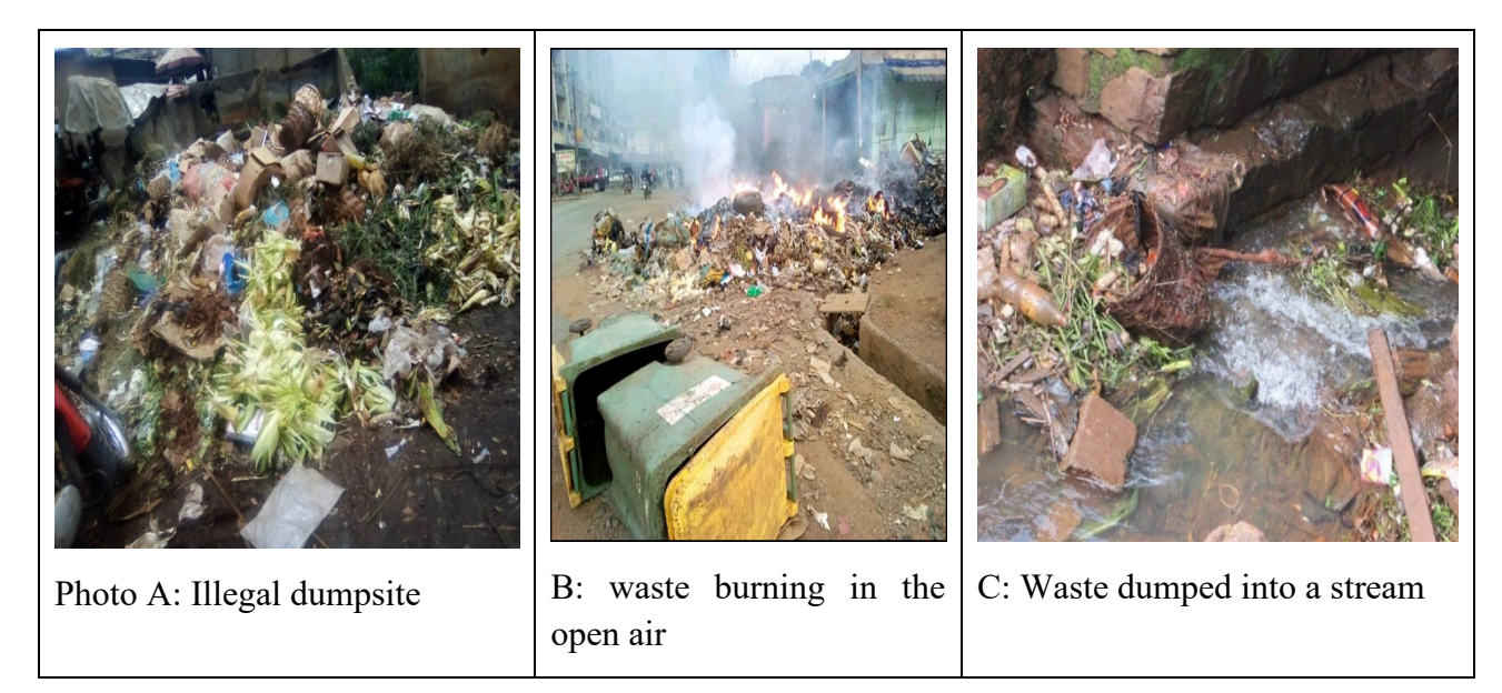
Figure 3: Illegal waste disposal practices in Dschang