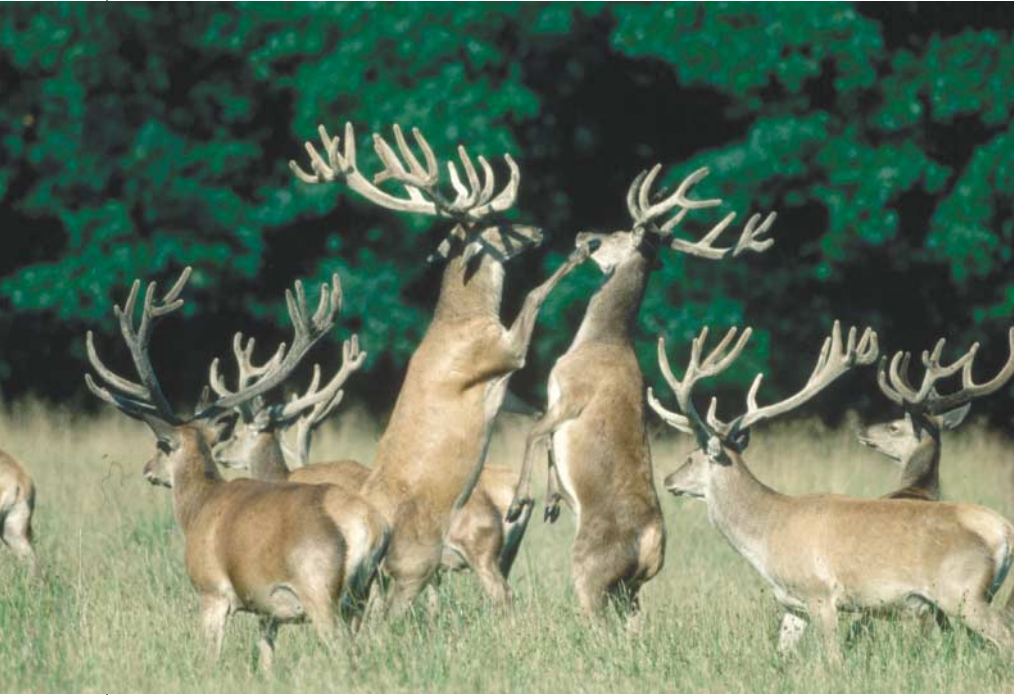
Rutting season: seeing off a younger rival.

Behavioural differences between men and women provide a good example of the combined effect of genes and social environment. It is quite possible that men and women might have maximized their fitness by behaving differently in the past. As a result, genetic, hormonal and other physiological differences might have evolved, inducing, for example, a higher tendency to promiscuity or more attempts to attain a high social status in men than in women. But