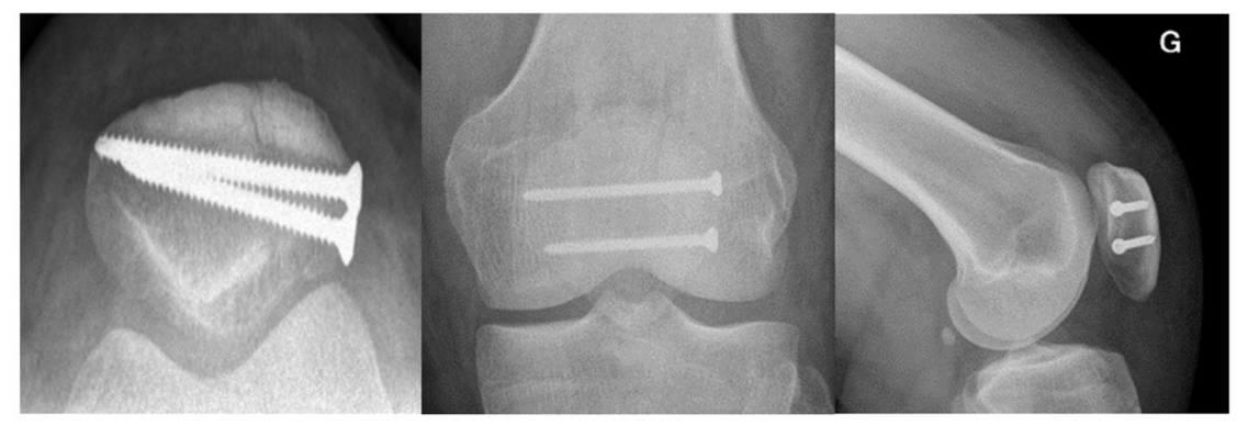
Figure 6: X-ray of knees with two screws for a longitudinal (vertical) fracture (CHUV.

A recent study by Taylor et al. reported the outcomes for eight patients with acute patellar fractures or nonunions treated with a combination of plates and interfragmentary screw fixation. All the patients went on to consolidation, with a mean range of motion of 129°. They reported no hardware removal for symptomatic implants. A second study by Thelen et al., published in 2012, compared three techniques of fixation for transverse fractures in the cadaver laboratory. This work showed that after 100 cycles of full extension to 90° flexion, the displacement of the frac-