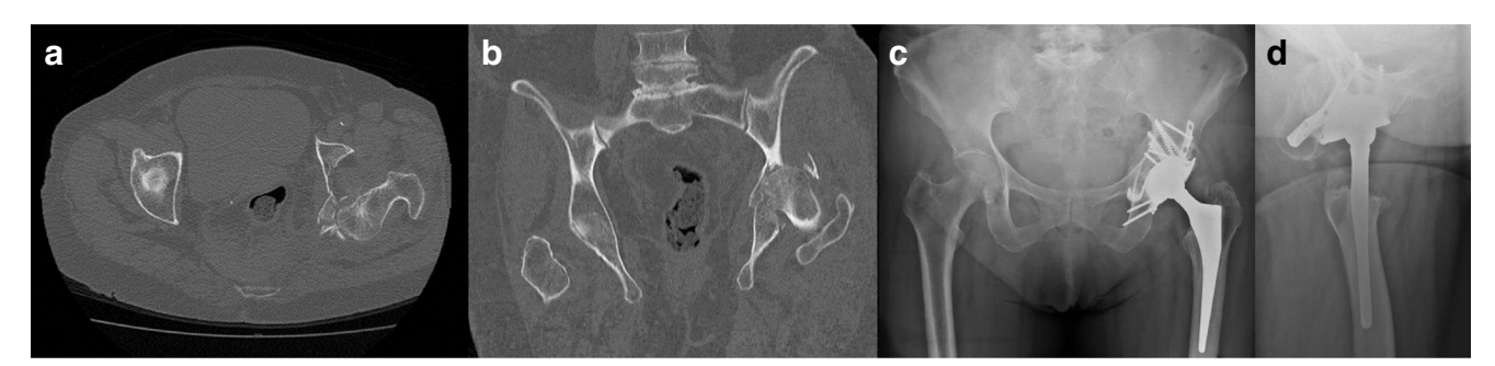
Fig. 2 Pre-operative axial (a) and coronal (b) views on CT scan of an 82-year-old female patient who sustained a comminuted posterior wall fracture associated with posterior hip dislocation treated by DM-CHP with

There were 21 patients in the SA-ORIF group and four patients in the CA-ORIF group. There were 18 patients in the SA-CHP group (Fig. 2) and eight patients in the CA-CHP group (Fig. 3). Mean surgery time and intra-operative blood loss were higher for combined approaches in each group. Early complication rate was 11.1% (2/18) in SA-CHP compared with 75% (6/8) in CA-CHP (p = 0.003). Early