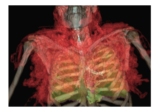
FIGURE 3: 3D reconstruction from images of the cervical-thoracic CT obtained emergency shows the distribution of emphysema in relation to other structures aeric content. Emphysema is shown in red; the trachea and bronchi are shown in blue, light green lung.

10 days. The thoracic tubes were pulled out at day 5. Over the next few days the inflammatory parameters settled and the general condition improved. The cervical drains were removed on the sixth day. A cervicothoracic CT scan performed on day 9 showed a complete resolution of the cervical pneumomediastinum, the pleural effusion, and the subcutaneous emphysema. A barium study done at 2 weeks was normal and the patient was restarted on feeds.