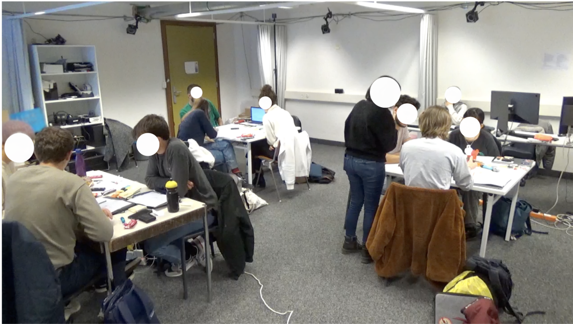
Figure 1: Participatory design workshop session. All participants and researchers faces in has been obfuscated to protect their privacy.

were asked to consent to the recording of their data by signing a consent form 11 . The session articulated five main steps and associated activities, as summarised in Fig. 2. We explain each of the steps below.