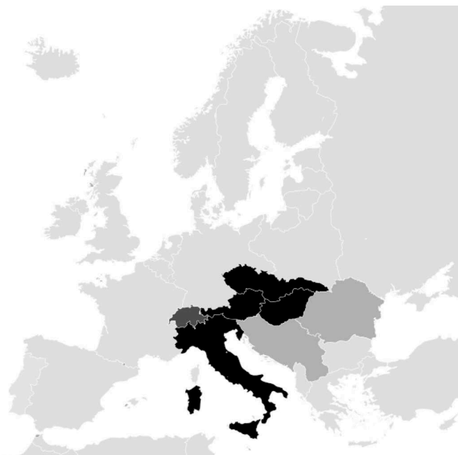
Map 2. National associations which participated in the Mitropa Cup in 1937. light grey: associations which did not participate; grey: associations which participated (one club); dark grey: associations which had two clubs in the competition.