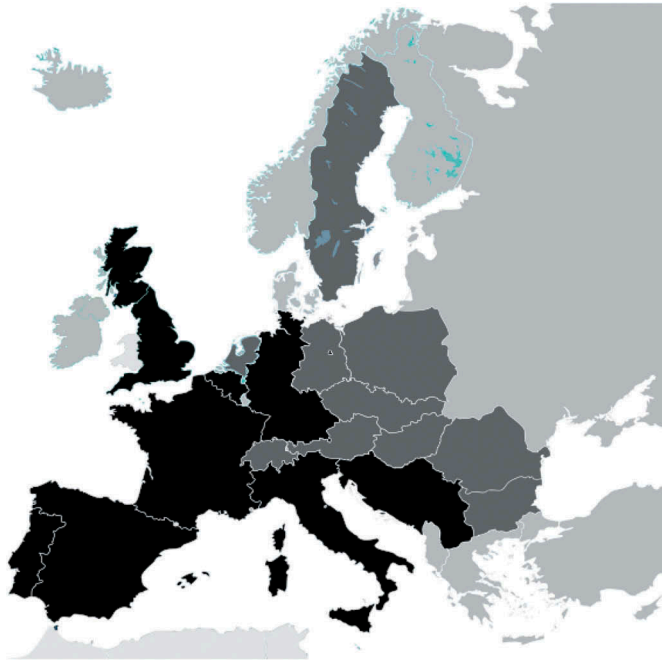
Map 6. National associations which participated in the first UEFA Cup. pale grey: associations which did not participate; grey: associations which participated with one club; dark grey: associations which had two clubs in the competition; black: associations that had between 3 and 4 clubs which took part in the competition.