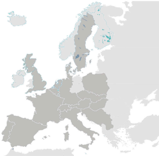
Map 3. National associations which participated in the first ECCC. pale grey: associations which did not participate; grey: associations which participated (one club).

In the following years, the success of the ECCC increased substantially. In 1956–7, the number of participating teams reached 22, which required the establishment of a preliminary round. At the