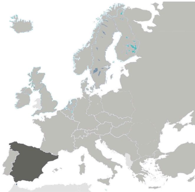
Map 4. National associations which participated in the ECCC in the season 1966–1967. pale grey: associations which did not participate; grey: associations which participated (one club); dark grey: associations which had two clubs in the competition (the previous winner was directly qualified for the next ECCC).

During the first half of the 1960s, UEFA was preparing to create other competitions and launched the European Winner Clubs' Cup (EWCC) comprising the winners of national championships. This tournament compelled the national associations to start relevant national level cups for sending their representative teams to the tournament. The joint success of ECCC and EWCC gave further fillip to the idea of organizing a Continental tournament among various stakeholders of the game including clubs, journalists and even political organizations (such as the European community). 56 In 1967, a round table meeting was held in Monaco with 25 clubs from 11 countries, many journalists and also the vice-president of UEFA, José Crahay (who did not represent UEFA but came in his personal capacity). 57 While the question of European competitions was widely