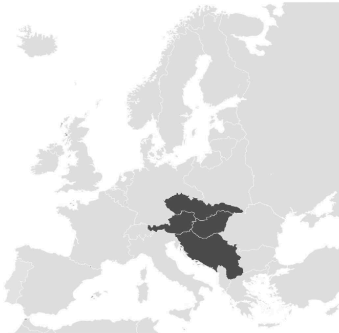
Map 1. National associations which participated in the Mitropa cup in 1927. light grey: associations which did not participate; dark grey: associations which had two clubs in the competition.

The Mitropa Cup's importance increased each year and, by the middle of the 1930s, it was established as a coveted championship for clubs in Central Europe. The competition had two legs (one game away, one game at home) and the team with maximum points won. In 1934, each country sent four representatives, which required establishing an additional elimination round. Two years later, the number of clubs continued to increase with the participation of Swiss teams. As the Swiss