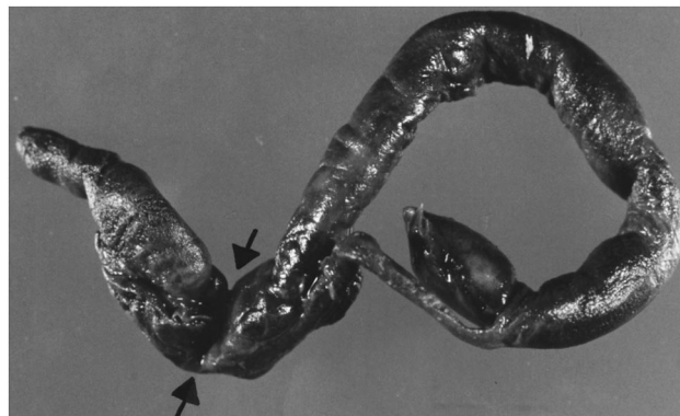
Fig. 2. Macroscopic view of the clot removed under cardio-pulmonary bypass. Arrows indicate inprint of the foramen ovale.

Numerous clots could also be removed from the left pulmonary artery (Fig. 2). An inferior vena cava filter was inserted post-operatively and the patient recovered uneventfully. At the 6 months follow-up visit, she was asymptomatic.