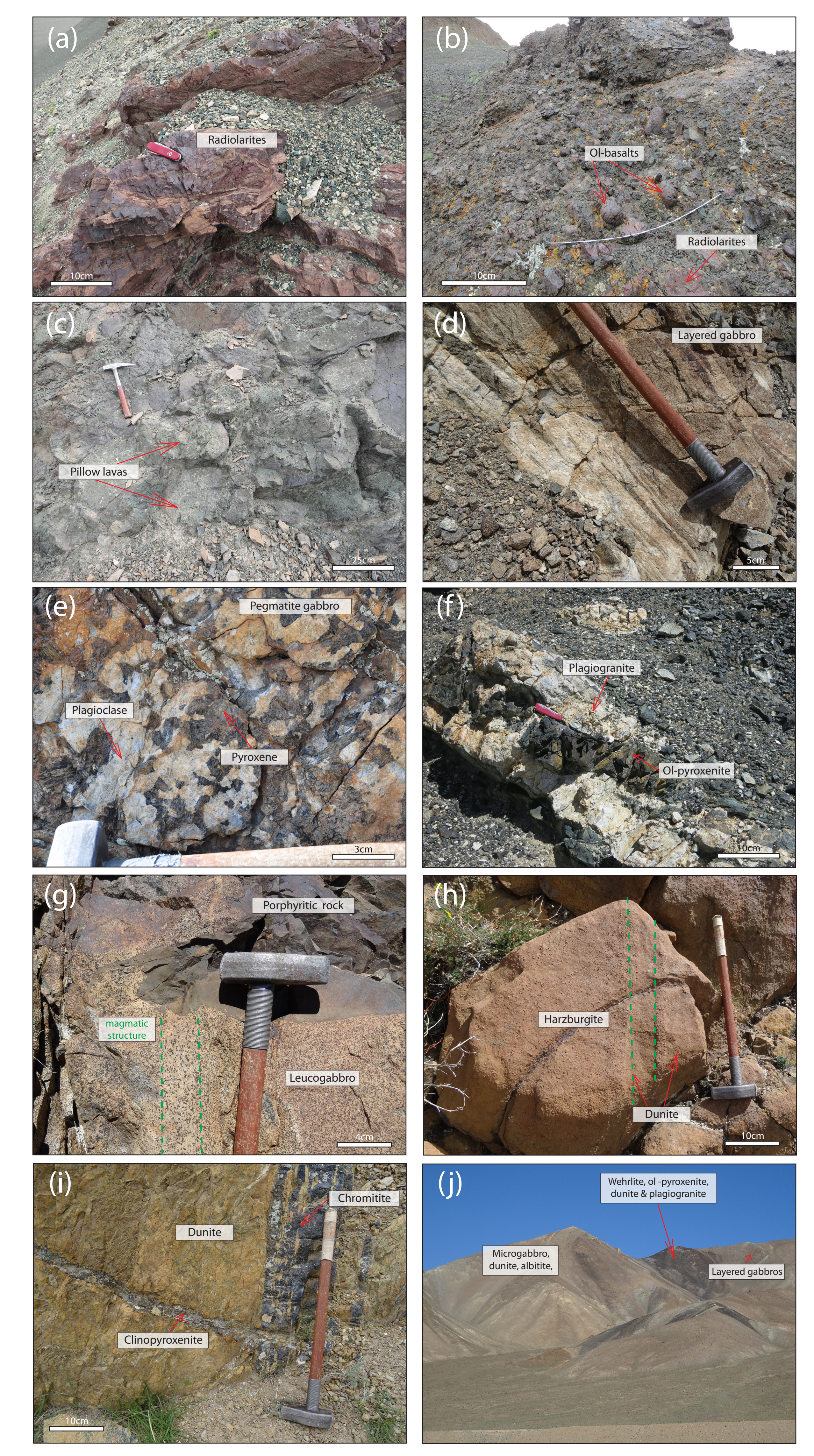
Fig. 2: (a) Red radiolarites of the Nidar sediments. (b) Ophiolitic conglomerates with basalt and radiolarite elements (Nidar sediments) (c) Pillow lavas. (d) Layered gabbro, white layers are manly composed by plagioclase and black layers by pyroxene. (e) Pegmatite-gabbro (pyroxene + plagioclase ± amphibole). (f) Plagiogranite (plagioclase + quartz + amphibole) in ol-pyroxenite (olivine + pyroxene). (g) Porphyritic rocks and microgabbros in leucogabbros (plagioclase + amphibole ± orthopyroxene), magmatic structure in green. (h) Dunite (olivine + Cr-spinel) in harzburgite (orthopyroxene + olivine + spinel). (i) Chromitite (Cr-spinel ± olivine) in dunite, clinopyroxenite cut the chromitite. (j) Intrusive complexes in layered gabbros.