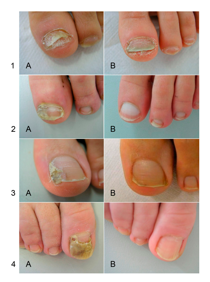
Figure 2. Efficacy of treatment with amphotericin B in topical application for NDM onychomycoses. ( A ) before treatment; ( B ) after treatment. The infectious agent identified by PCR was Fusarium sp. in patients 1 and 2, and Aspergillus oryzae in patients 3 and 4. Figure from Monod et al., Rev Med Suisse. 2013, 380:730-3, with permission of the Editor.