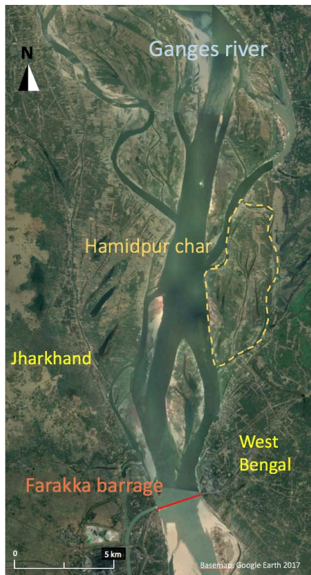
Figure 6: Location map of Hamidpur char , Malda district, West Bengal

In order to illustrate the dialectical co-production of river, sediment and society, and instead of labelling each paragraph as in the previous section, the main features of the hydrosocial cycle in this story, here shifting assemblages of representations and meanings of land and water, technology, materiality of river, uses, institutional arrangements and power equations, are first summed up in the box below with ten main points.