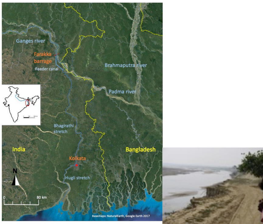
Figure 2: Schematic map of the Lower Ganges basin

bifurcates 1 into two major branches, the Padma River (in a south-east direction, towards Bangladesh) and the Bhagirathi River (to the south, towards the city of Kolkata). In the centuries leading up to the Farakka Barrage, the Ganga-Padma River was the main branch. The slowly decaying Bhagirathi River used to bifurcate about 40 km downstream, near Mithipur, Murshidabad district. However, the commissioning of the Farakka Barrage in 1975 on the Ganges, a diversion structure designed to increase the flow in the Bhagirathi River, put an end to the natural degeneration of that channel. The Bhagirathi River is now constituted of a 39-km long feeder canal that is derived from upstream of the barrage, and joins the sea about 300 km downstream. In its tidal stretch, notably in Kolkata, the river is named Hugli River. The river finally merges with the Indian Ocean near Sagar Island, on the western side of the Sundarbans, a complex of coastal islands. Dynamic phenomena of coastal erosion, accretion and submersion continuously shape and reshape these deltaic islands or tidal bars (see Figure 2 ).