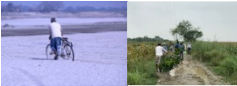
Figure 4: Pre-monsoon 'muddyscape', Nirmal char , Murshidabad district, West Bengal

We visited this char and its inhabitants several times in 2010 for a study on livelihoods and ecosystem services, then again in July 2017 for the purpose of this research. We also visited other chars in the Murshidabad district. We travelled in pre-monsoon period, where one has to walk kilometres (no vehicle apart from tractors may drive on the thick sand layer) on sandy land, sometimes cultivated with underground water use or sometimes bare; we also travelled in monsoon or post-monsoon periods, when only small boats or ferries allow one to reach destinations and when green and dense fields of jute or rice demonstrate the fertility of the plain's soils (see Figures 4 and 5 ).