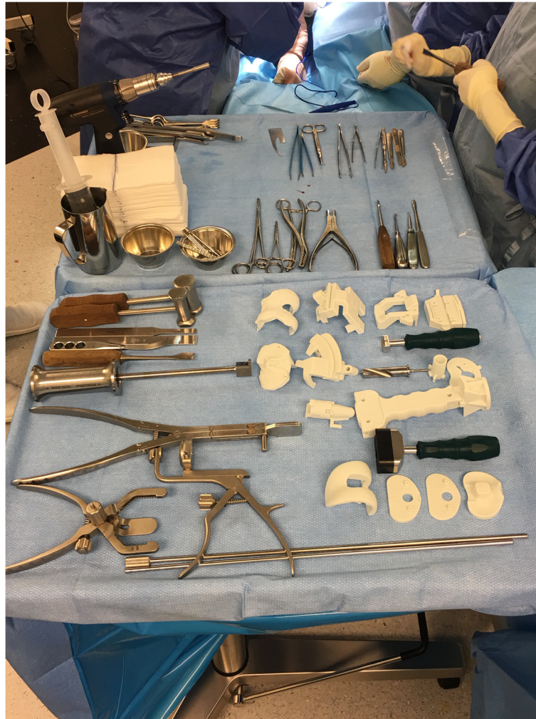
Fig. 2 Two surgical instrument trays in the operating room. The upper tray contains standard metal instruments. The lower tray contains standard metal instruments and the different CT-based, patient-specific, single-use instruments, ancillary and cutting guides (Knee-Plan® Set), shown in white. Single-use material in first (top) row, from left to right: femoral model, distal femoral cutting guide, intercondylar cutting block, 4-in-1 cutting block. Second row: tibial model, tibial cutting guide, tibial drill guide, tibial trial. Third row: tibial stem trial, impactor with impaction pad. Fourth (bottom) row: femur trial, 2 trial insert augments (+2mm and +5mm), trial insert

to be used per case. Fewer instrument trays provide a considerable advantage for both the surgeon and the scrub nurse, for obvious reasons such as material handling and space occupancy. It is important to note that, even with the single-use instrumentation, other basic instrumentation trays with standard material must be utilised (Fig. 2). In a systematic review of the use of patient-specific cutting blocks for TKA, Sassoon et al. also found that fewer trays were needed with patient-specific instrumentation, but they were not able to support its cost-effectiveness [17].