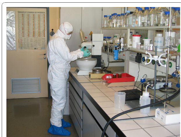
Figure 7 Illustration of personal protective equipment for work with nano. Illustration of personal equipment to be used in a Nano 3 laboratory.

Present knowledge on nanomaterial toxicity is insufficient for completing precise risk assessment. Threshold Limit Values for nanomaterials do not exist nor is there standard equipment for sufficiently detailed routine exposure measurements. However, since preliminary scientific evaluations show that there are reasonable grounds for concern that activity with nanomaterials might have damaging effects on human health; the precautionary principle must be applied. Here we propose practical, clear and simple procedure for Nano safety and health management, which is a general approach based on the state of the nanomaterial in question (fibers and particles as powder, suspension, or in a solid matrix). New hazard knowledge will be used as it is developed and made available. The procedure proposes