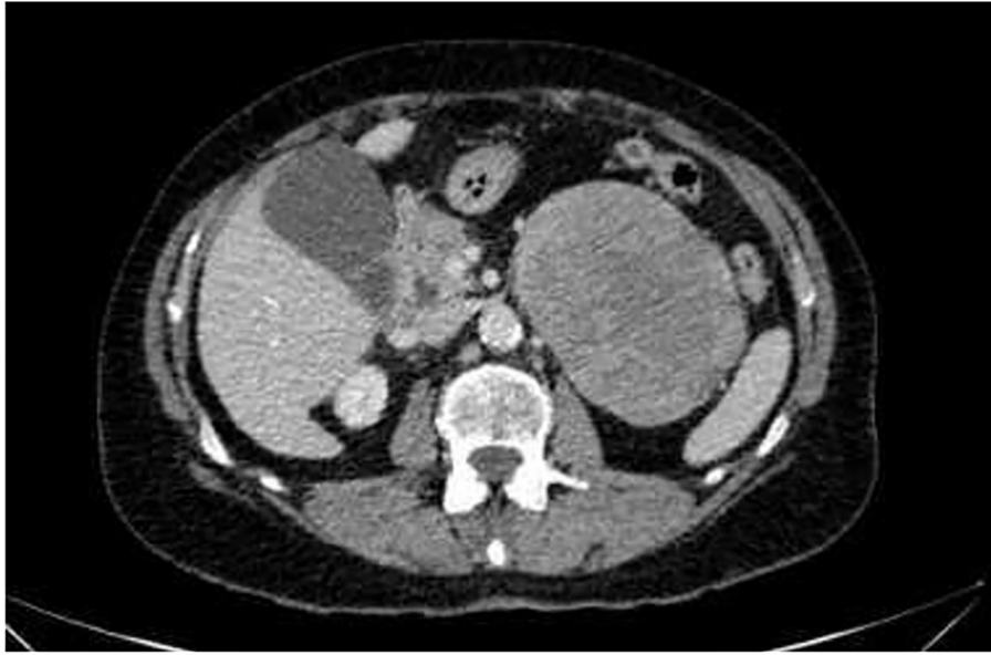
FIGURE 1 | CT-scan of the abdomen. Axial CT scan of the abdomen reveals a large abdominal mass measuring 10 × 8 × 10 cm without lymphadenopathy.

adrenal glands (11, 12). However, it is worth noting that they can arise anywhere throughout the sympathetic nervous system, such as the thorax or the neck (11).