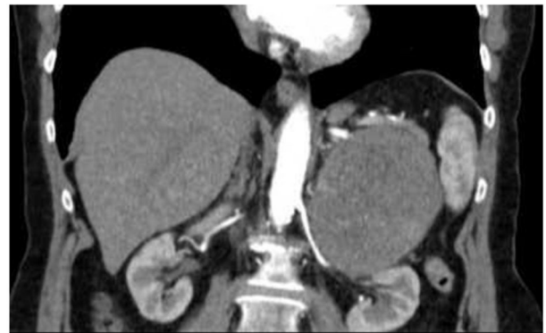
FIGURE 2 | CT-scan of the abdomen. Coronal-view CT scan of the abdomen reveals a large abdominal mass measuring 10 × 8 × 10 cm without lymphadenopathy.

GNB, NB and GN are three separate diseases with different outcomes: malignant for NB, intermediate for GNB and benign for GN. NB and GNB have different clinical behaviors with some