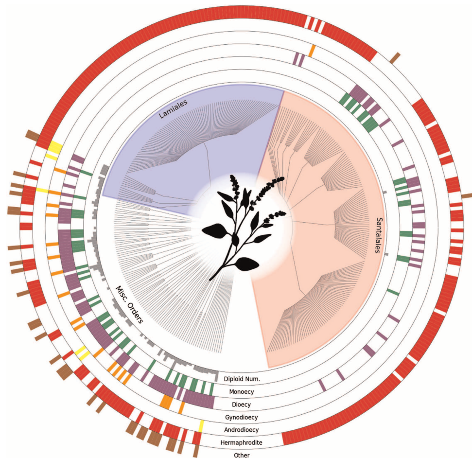
Figure 1. Distribution and sample of plant data from the Tree of Sex Database. Tree structure is derived from taxonomy, where each tip represents all species in a single genus. Diploid chromosome number is indicated by the height of the innermost ring; all other rings indicate the presence or absence of the trait named at the base of the ring. The 'Other' ring includes the states: apomictic, gynomonoeicy, andromonoeicy, polygamodioecy, and polygamomonoeicy. The sexual trait data displayed in the rings is based on 11,038 plant entries.