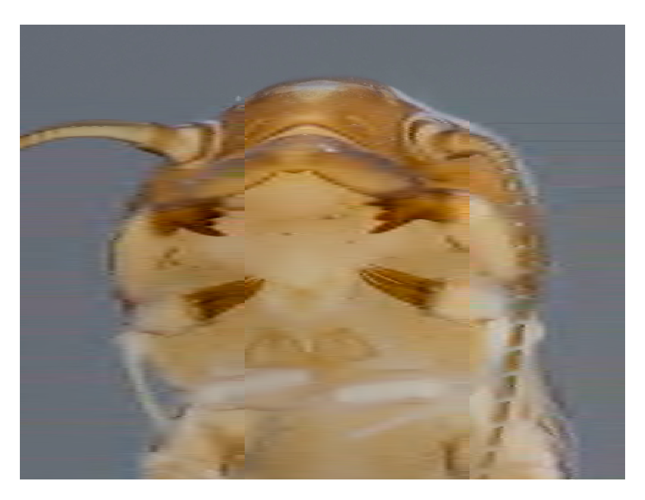
Figure 11. Guloptiloides gargantua Gattolliat & Sartori (Baetidae, Madagascar) details of the head in ventral view; mandibles and maxillae blade-like to prey mainly on other baetid larvae.

However, this relationship actually is commensal in nature [31]. The association of mayflies with mussels in this way is a remarkable parallel coincidence when one considers the early developmental and dispersal biology of mussels, which involves attachment of larvae (glochidia) to fish gills.