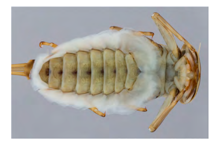
Figure 4. Rhithrogena loyolaea Navás (Heptageniidae, Switzerland) in ventral view to show the gills adapted to function as a suction disk.

Several taxa, such as species of the genera Coloburiscus Eaton (Coloburiscidae), Isonychia Eaton (Isonychiidae), and Oligoneuria Pictet (Oligoneuriidae) (Figure 5) are filter feeders and may use rows of setae on their forelegs to capture particulate matter passively; others, such as Arthroplea Bengtsson (Heptageniidae) may use specialized maxillary palps (Figure 6) to create vortices that actively concentrate particles from the water column [25], while others yet, such as Ametropus Albarda (Ametropodidae), may use the forelegs to create such a vortex [26]. Burrowing mayflies have legs and tusks modified for digging (Figures 7 and 8) in a variety of benthic habitats including clay banks and heavy muck, and they use their gills to help move water through their burrows in order to collect food items [27]. Very few of these burrowing taxa, such as Povilla adusta Navás (Polymitarcyidae), bore into rotting wood, sometimes causing problems with human structures submerged in water [28]. Other mayfly taxa live and forage on or among sediments; these taxa often have operculate gills (Figure 9) that protect subjacent gills (e.g., most Caenidae and some Ephemerellidae) or modified abdominal