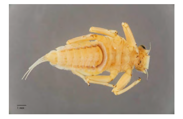
Figure 2. Dodds' spiny crawler mayfly, Drunella doddsii (Needham) (Ephemerellidae, USA) in ventral view; abdominal sternites with rows of setae as a friction disk to adhere to the substrate in a fast flowing stream.

The strictly aquatic larvae, also called nymphs, are comprised of several instars. The number of instars that occur during an individual's life depends primarily on food resources [19] and water temperature (e.g., [20]). The larvae are common constituents of most freshwater biotopes, both lotic and lentic, and in some cases can tolerate brackish water at least temporarily [21,22]. The larvae are found on or in almost all submerged substrates. Their near ubiquity in freshwaters indicates how widely mayflies are contributing to ecosystem services. Their absence can be an indicator of problems in particular environments (see further discussion below). Fortunately, mayfly larvae are easily distinguished from other aquatic insects. The larvae of mayflies usually have three terminal filaments (e.g., Figures 2–4), though some have two. Larvae have prominent forewing pads (Figure 3); hindwing pads are much smaller, sometimes being vestigial, or absent. Larvae have ten abdominal segments, with pairs of articulated gills on at most segments one through seven (Figure 3). The body lengths (excluding terminal filaments) of the vast majority of species fall between about 2 to 30 mm.