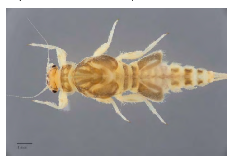
Figure 9. Caenis luctuosa (Burmeister) (Caenidae, Switzerland) in dorsal view; the second pair of gills is operculate and protects the delicate subjacent ones.