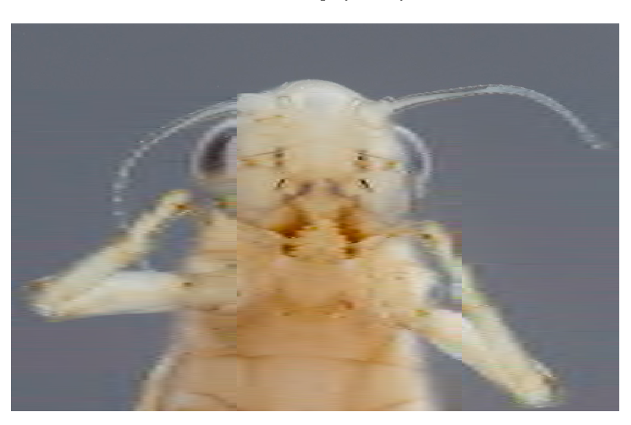
Figure 12. Edmulmeatus grandis Lugo-Ortiz & McCafferty (Baetidae, Madagascar) detail of head in ventral view; mandibles are cricket-like; this species shreds exclusively on Hydrostachys Thouars (Cornales: Hydrostachyaceae) aquatic plants and is completely green when alive.

In many cases, the feeding preferences and general habits of mayfly taxa are assumed based on their morphologies [30] and have not been observed directly. Expanding our knowledge of the microhabitats, movement, and feeding behaviors of mayflies will help us also to expand our knowledge of the precise ecosystem services provided by mayflies.