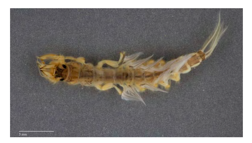
Figure 8. Larva of Cheirogenesia edmundsi Sartori & Elouard (Palingeniidae, Madagascar) in dorsal view; a burrower which digs into hard substrates, such as clay.