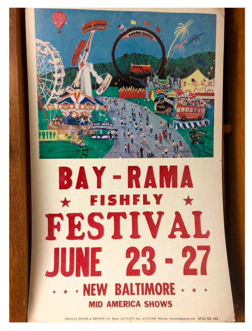
Figure 13. Advertising poster from "fishfly" festival in New Baltimore, Michigan, USA, ca. 2004. The annual celebration usually coincides with the mass emergence of Ephemeridae from Lake Saint Clair, which is located on the Michigan, USA and Ontario, Canada borderline.

and Heptagenia sulphurea were being published [56]. Fly-fishing is now a world-wide pastime enjoyed by millions of people. Various assessments have been made of the economic importance of fly-fishing. In the United Kingdom, for example, game fishing is worth £498 million to the economy annually [57,58]. In another example from the USA, some 25.4 million people are believed to participate in freshwater fishing, contributing US$31.4 billion to the USA economy [59].