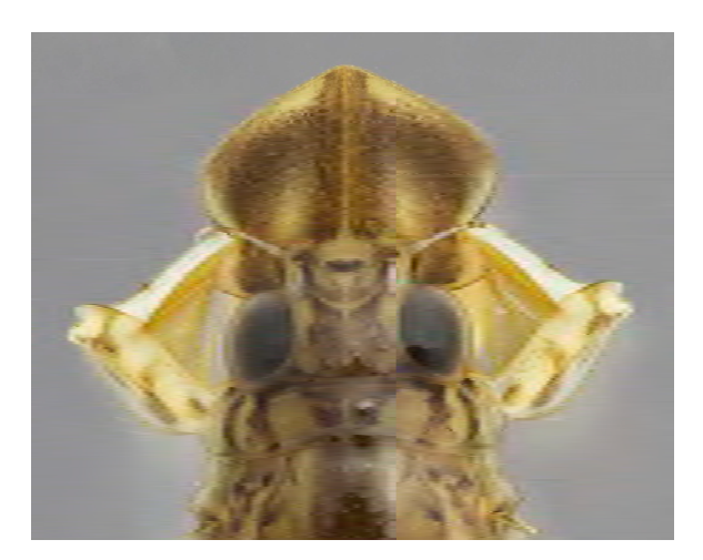
Figure 5. Oligoneuria mitra Salles, Soares, Massariol & Faria (Oligoneuriidae, Brazil) detail of head and prothorax in dorsal view; the first pair of legs equipped with filtering setae.

segments that protect the gills (e.g., Hyrtanella Allen & Edmunds (Ephemerellidae), Machadorythus Demoulin (Machadorythidae) Figure 10).