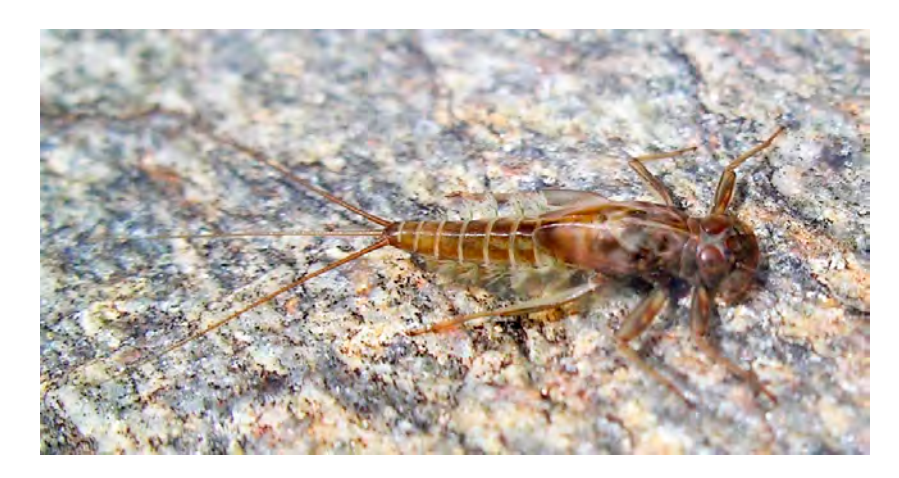
Figure 3. Rhithrogena loyolaea Navás (Heptageniidae, Switzerland) in dorsolateral view in its natural habitat; the flattened body, strong legs and first pair of gills functioning as a suction disk allow this species to withstand very strong current speed.

such as friction disks formed by setae (e.g., some Drunella Needham (Ephemerellidae), Figure 2) and gills (e.g., Rhithrogena Eaton (Heptageniidae), Figure 4), enable individuals to maintain their purchase while feeding [24]. These collector-gatherer and scraper taxa are generally clinging, sprawling, and swimming in habit, with these tendencies facilitated by the morphology of their claws and orientation of legs, generally flattened bodies (Figure 3), or streamlined bodies, respectively.