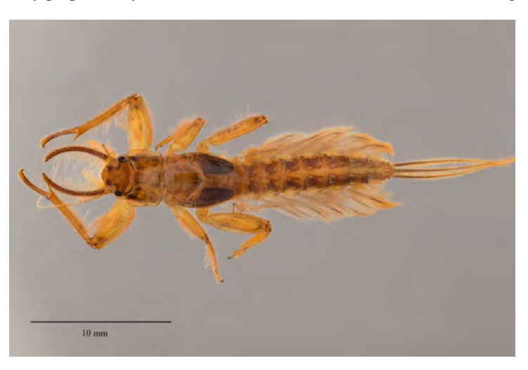
Figure 7. Ultimate larval instar of Polyplocia campylociella Ulmer (Euthyplociidae, Borneo) in dorsal view; a semi-burrower that uses its long mandibular tusks to dig soft substrate under cobble.

Figure 6. Arthroplea congener Bengtsson (Heptageniidae, Switzerland) in dorsal ( a ), and lateral ( b ) view: head, with maxillary palps clearly visible on the sides that are used to create filtering vortices.