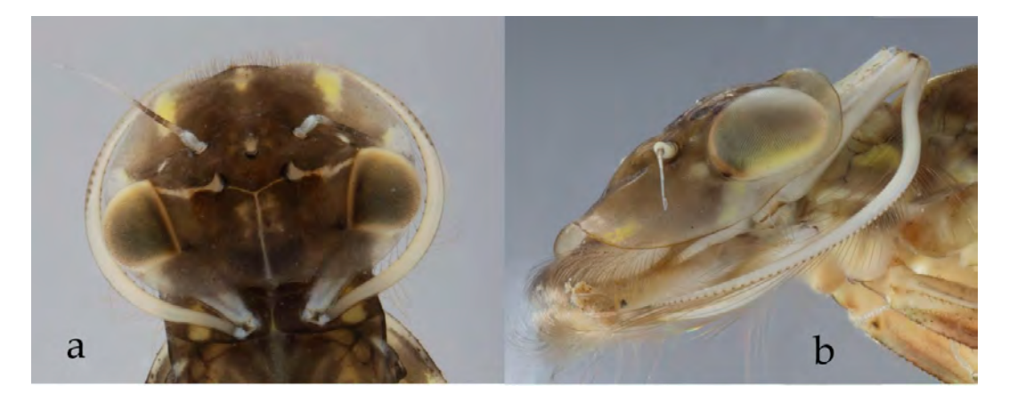
Figure 6. Arthroplea congener Bengtsson (Heptageniidae, Switzerland) in dorsal ( a ), and lateral ( b ) view: head, with maxillary palps clearly visible on the sides that are used to create filtering vortices.