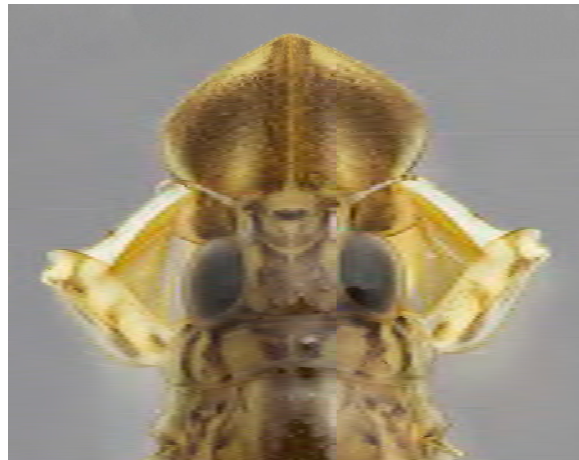
Figure 5. Oligoneuria mitra Salles, Soares, Massariol & Faria (Oligoneuriidae, Brazil) detail of head and prothorax in dorsal view; the first pair of legs equipped with filtering setae.

segments that protect the gills (e.g., Hyrtanella Allen & Edmunds (Ephemerellidae), Machadorythus Demoulin (Machadorythidae) Figure 10).