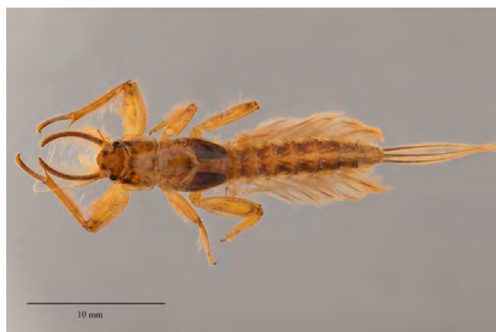
Figure 7. Ultimate larval instar of Polyplocia campylociella Ulmer (Euthyplociidae, Borneo) in dorsal view; a semi-burrower that uses its long mandibular tusks to dig soft substrate under cobble.