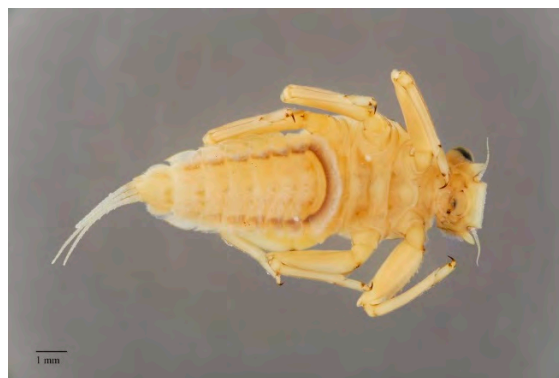
Figure 2. Dodds' spiny crawler mayfly, Drunella doddsii (Needham) (Ephemeroptera, USA) in ventral view; abdominal sternites with rows of setae as a friction disk to adhere to the substrate in a fast flowing stream.

The strictly aquatic larvae, also called nymphs, are comprised of several instars. The number of instars that occur during an individual's life depends primarily on food resources [19] and water temperature (e.g., [20]). The larvae are common constituents of most freshwater biotopes, both lotic and lentic, and in some cases can tolerate brackish water at least temporarily [21,22]. The larvae are found on or in almost all submerged substrates. Their near ubiquity in freshwaters indicates how widely mayflies are contributing to ecosystem services. Their absence can be an indicator of problems in particular environments (see further discussion below). Fortunately, mayfly larvae are easily distinguished from other aquatic insects. The larvae of mayflies usually have three terminal filaments (e.g., Figures 2–4), though some have two. Larvae have prominent forewing pads (Figure 3); hindwing pads are much smaller, sometimes being vestigial, or absent. Larvae have ten abdominal segments, with pairs of articulated gills on at most segments one through seven (Figure 3). The body lengths (excluding terminal filaments) of the vast majority of species fall between about 2 to 30 mm.