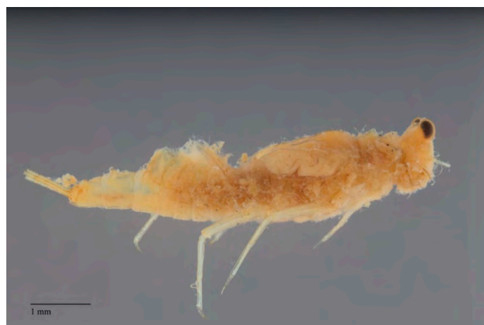
Figure 10. Machadorythus maculatus (Kimmins) (Machadorythidae, Ivory Coast) in lateral view; with middle abdominal segments modified to form a gills basket.

Other taxa are predators (Figure 11), usually feeding on Chironomidae (Diptera) larvae or other mayflies (e.g., [29]). A few taxa may be leaf and vegetation shredders [30] (Figure 12). Rarely, mayflies are considered parasitic, such as the case of Symbiocloeon Müller-Liebenau (Baetidae) on mussels.