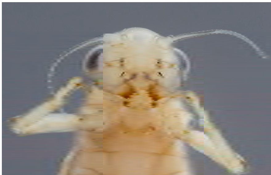
Figure 12. Edmulmeatus grandis Lugo-Ortiz & McCafferty (Baetidae, Madagascar) detail of head in ventral view; mandibles are cricket-like; this species shreds exclusively on Hydrostachys Thouars (Cornales: Hydrostachyaceae) aquatic plants and is completely green when alive.

In many cases, the feeding preferences and general habits of mayfly taxa are assumed based on their morphologies [30] and have not been observed directly. Expanding our knowledge of the microhabitats, movement, and feeding behaviors of mayflies will help us also to expand our knowledge of the precise ecosystem services provided by mayflies.