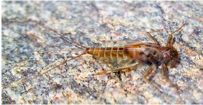
Figure 3. Rhithrogena loyolaea Navás (Heptageniidae, Switzerland) in dorsolateral view in its natural habitat; the flattened body, strong legs and first pair of gills functioning as a suction disk allow this species to withstand very strong current speed.

such as friction disks formed by setae (e.g., some Drunella Needham (Ephemerellidae), Figure 2) and gills (e.g., Rhithrogena Eaton (Heptageniidae), Figure 4), enable individuals to maintain their purchase while feeding [24]. These collector-gatherer and scraper taxa are generally clinging, sprawling, and swimming in habit, with these tendencies facilitated by the morphology of their claws and orientation of legs, generally flattened bodies (Figure 3), or streamlined bodies, respectively.