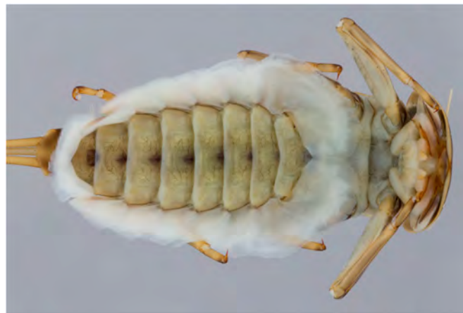
Figure 4. Rhithrogena loyolaea Navás (Heptageniidae, Switzerland) in ventral view to show the gills adapted to function as a suction disk.

Several taxa, such as species of the genera Coloburiscus Eaton (Coloburiscidae), Isonychia Eaton (Isonychiidae), and Oligoneuria Pictet (Oligoneuriidae) (Figure 5) are filter feeders and may use rows of setae on their forelegs to capture particulate matter passively; others, such as Arthroplea Bengtsson (Heptageniidae) may use specialized maxillary palps (Figure 6) to create vortices that actively concentrate particles from the water column [25], while others yet, such as Ametropus Albarda (Ametropodidae), may use the forelegs to create such a vortex [26]. Burrowing mayflies have legs and tusks modified for digging (Figures 7 and 8) in a variety of benthic habitats including clay banks and heavy muck, and they use their gills to help move water through their burrows in order to collect food items [27]. Very few of these burrowing taxa, such as Povilla adusta Navás (Polymitarcyidae), bore into rotting wood, sometimes causing problems with human structures submerged in water [28]. Other mayfly taxa live and forage on or among sediments; these taxa often have operculate gills (Figure 9) that protect subjacent gills (e.g., most Caenidae and some Ephemerellidae) or modified abdominal