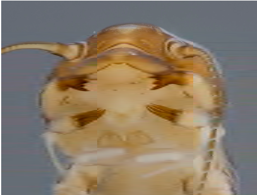
Figure 11. Guloptiloides gargantua Gattolliat & Sartori (Baetidae, Madagascar) details of the head in ventral view; mandibles and maxillae blade-like to prey mainly on other baetid larvae.

However, this relationship actually is commensal in nature [31]. The association of mayflies with mussels in this way is a remarkable parallel coincidence when one considers the early developmental and dispersal biology of mussels, which involves attachment of larvae (glochidia) to fish gills.