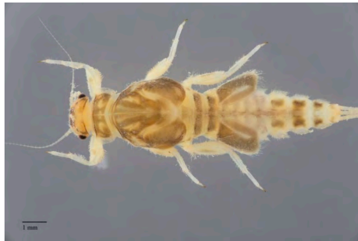
Figure 9. Caenis luctuosa (Burmeister) (Caenidae, Switzerland) in dorsal view; the second pair of gills is operculate and protects the delicate subjacent ones.