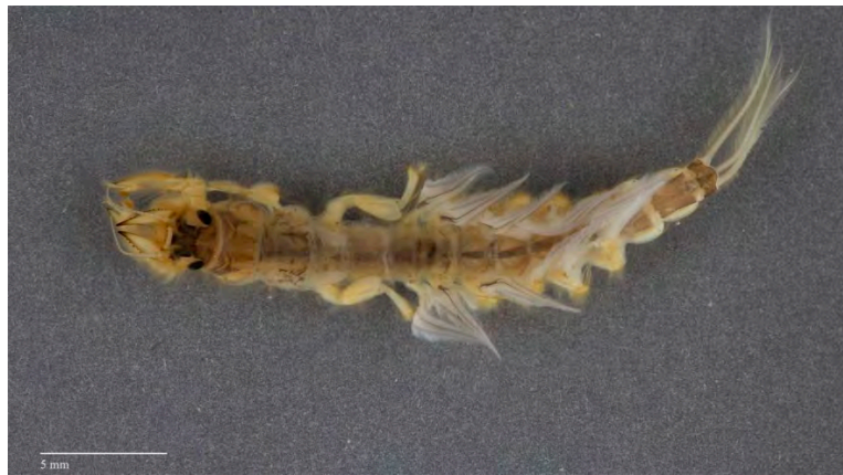
Figure 8. Larva of Cheirogenesia edmundsi Sartori & Elouard (Palingeniidae, Madagascar) in dorsal view; a burrower which digs into hard substrates, such as clay.