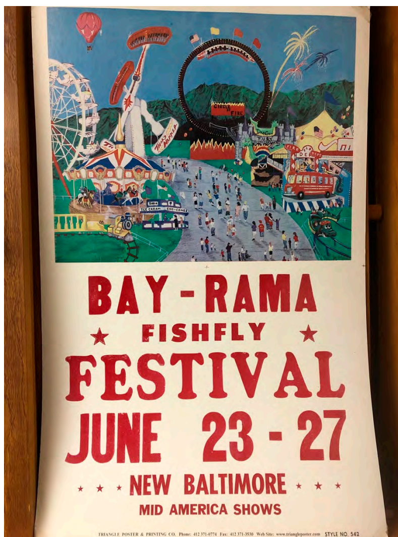
Figure 13. Advertising poster from “fishfly” festival in New Baltimore, Michigan, USA, ca. 2004. The annual celebration usually coincides with the mass emergence of Ephemeroidea from Lake Saint Clair, which is located on the Michigan, USA and Ontario, Canada borderline.

and Heptagenia sulphurea were being published [56]. Fly-fishing is now a world-wide pastime enjoyed by millions of people. Various assessments have been made of the economic importance of fly-fishing. In the United Kingdom, for example, game fishing is worth £498 million to the economy annually [57,58]. In another example from the USA, some 25.4 million people are believed to participate in freshwater fishing, contributing US$31.4 billion to the USA economy [59].