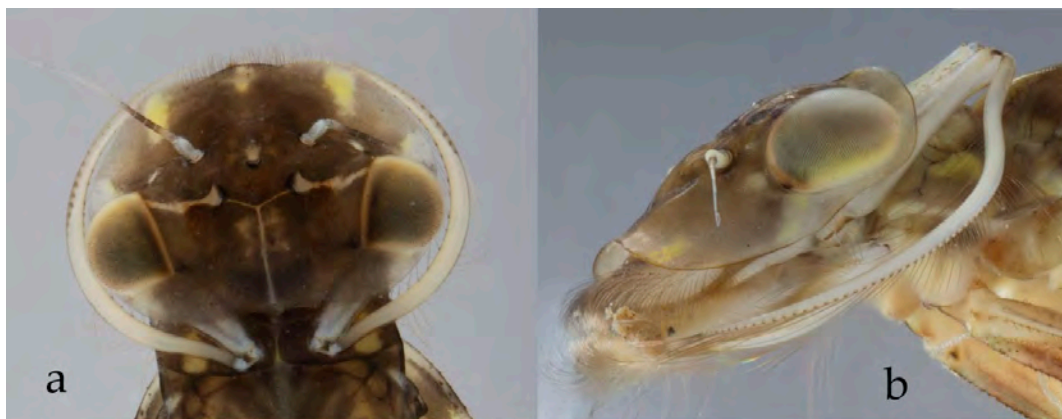
Figure 6. Arthroplea congener Bengtsson (Heptageniidae, Switzerland) in dorsal (a), and lateral (b) view: head, with maxillary palps clearly visible on the sides that are used to create filtering vortices.