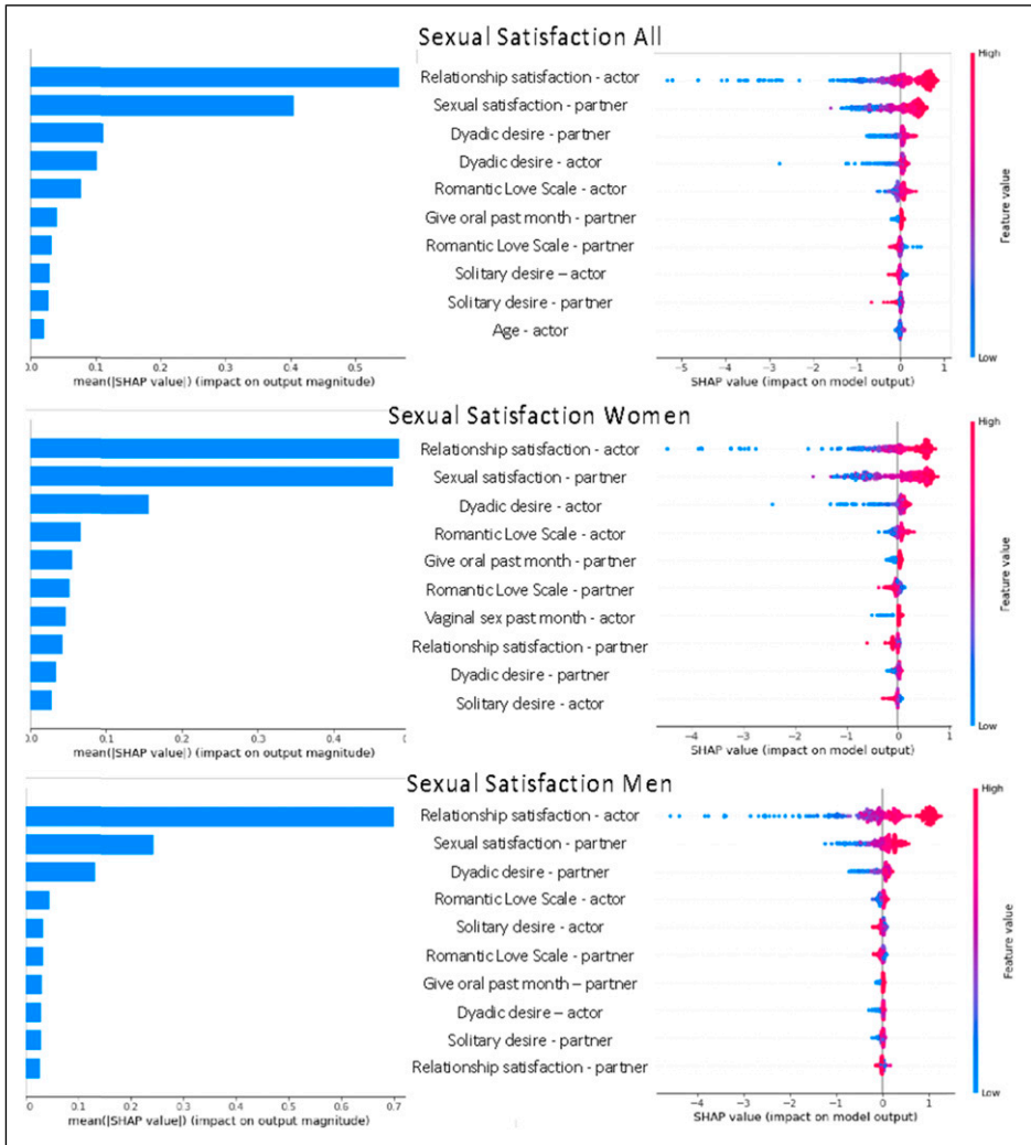
Figure 3. The top-10 most important predictors for sexual satisfaction in Sample 2 with actor and partner Effects. Note. The left graph presents the mean effect size for each variable and the right graph shows the size and direction of the effect for each data point.

poorer physical health predicted lower levels of sexual satisfaction. In the dyadic analyses (Figure 3), both actor and partner variables were in top-10 with partner’s sexual satisfaction, romantic love, dyadic desire, and relationship satisfaction all contributing to the actor’s sexual satisfaction. For women, partner’s sexual satisfaction was almost as predictive of women’s sexual satisfaction than their own relationship satisfaction. For men, this association was much smaller.