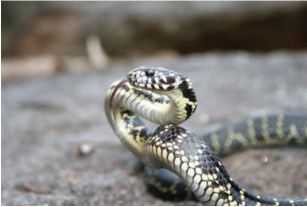
Figure 1. Adult broad-headed snake ( H. bungaroides ) in defensive posture.

the continued viability of sink populations depends upon preventing the destruction or degradation of source habitats and populations (e.g., Tittler et al. 2006).