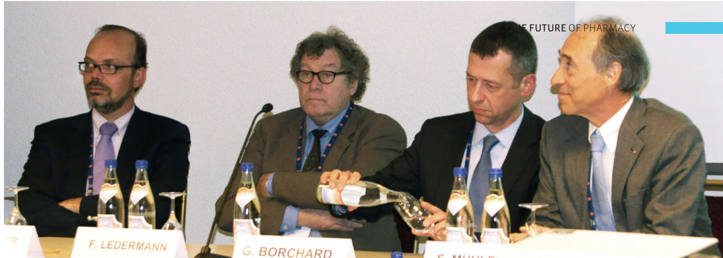
Fig. 1. Round table

In this context, the roles of health professionals are clearly destined to evolve. In parallel, patients are increasingly interconnected and want to have a voice. The future seems to be in the regional, national and international networks and expectations are high towards computer tools to improve medicine in the 21 st century. These tools tend thus to become the nervous system of public health. We must be able to communicate, understand, decide, manage and develop our health systems in a world where information is becoming a real strategic issue, more and more every day.