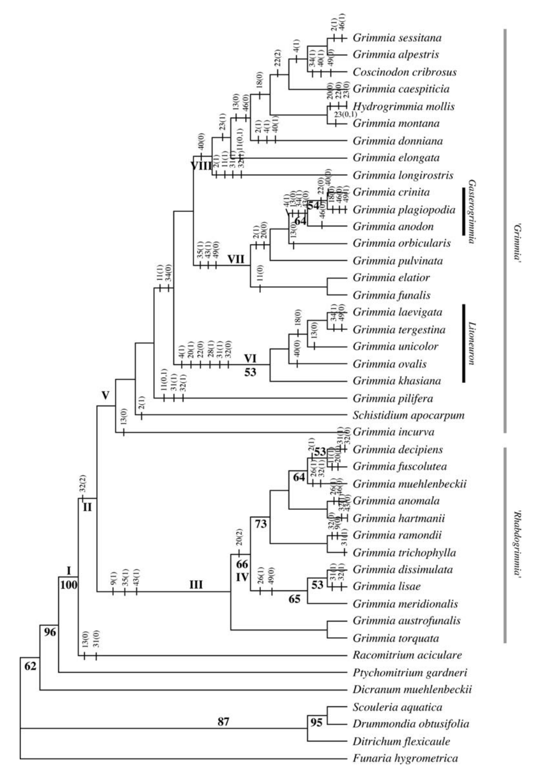
Figure 2. Tree obtained with two successive RC-weightings using rps 4, trnL-trn F and morphological characters. Bootstrap values (> 50%) shown above branches. Important changes in character states are placed on the tree. In bracket: character state. I–VIII: important nodes.