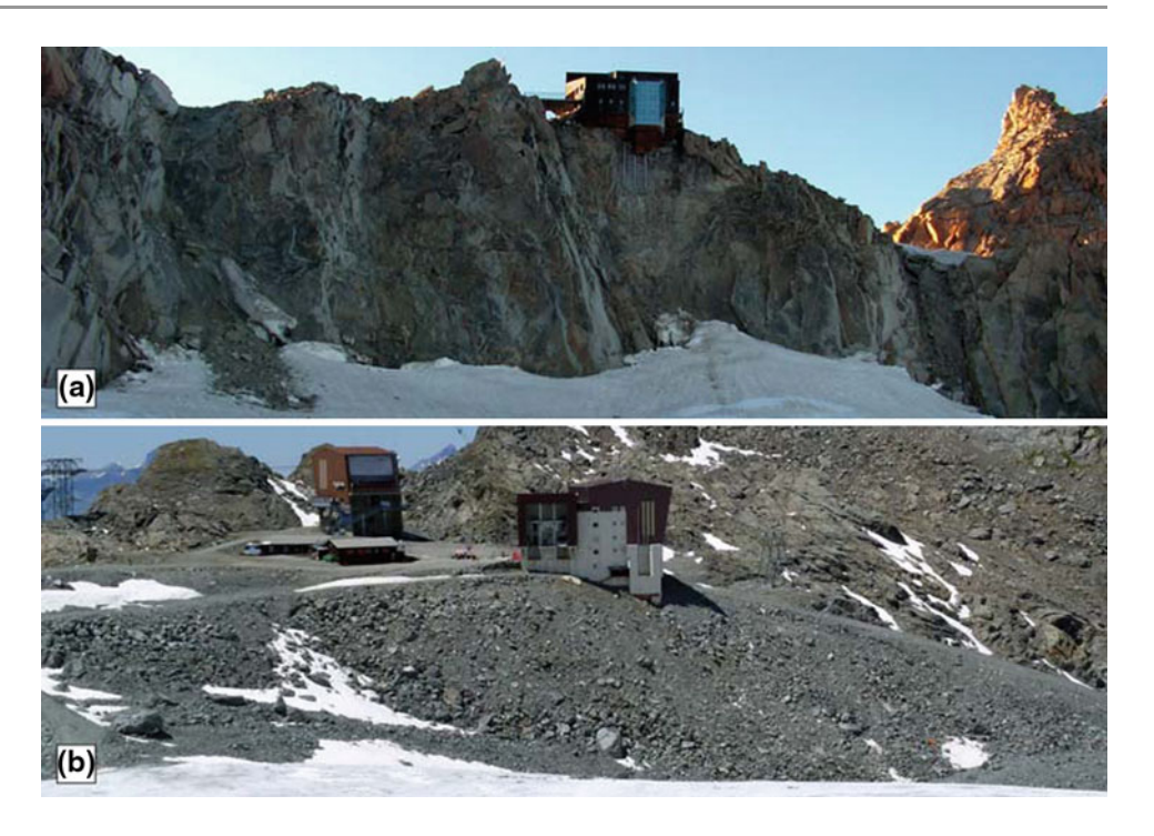
Fig. 32.1 a The lower Arête des Cosmiques with the Cosmiques hut (3613 m a.s.l.) on it; b the inner side of the Gentianes moraine (2894 m a.s.l.) with its lower Mont Fort cable-car station

models. Their diachronic comparison shows few important rock detachments between 2009 and 2011. The second one is the Col des Gentianes (2894 m a.s.l., Valais, Switzerland) where is located a cable-car station. Since the early 1980s the moraine is unstable: its inner slope has retreated for several meters. Since 2007, the moraine is monitored by TLS: 8 campaigns were conducted between July 2007 and October 2011. The comparison of the high resolution 3D models obtained allowed the detection and quantification of mass movements that have affected the moraine over this period.