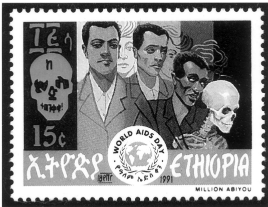
This stamp was issued by Ethiopia on 31 January 1991 to publicize World Health Day and the fight against AIDS. It illustrates a man in the stages of the disease.