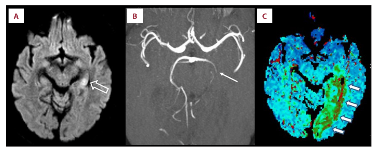
Figure 1. Brain Magnetic Resonance Imaging of a Patient with Left Hippocampal Acute Infarction due to an Occlusion of the Left Posterior Cerebral Artery (PCA) in the P2 segment. Axial diffusion weighted imaging with b=1000 value (A) showing left hippocampal diffusion restriction (thick arrow) consistent with acute ischemic stroke in the PCA territory. Transversal maximum intensity projection time-of-flight image showing occlusion (thin arrow) of the left PCA in the P2 segment (B) with corresponding extensive perfusion deficit (multiple arrows) in the time to peak map (C).

A 61-year-old white man with a past medical history of melanoma excision, no known vascular risk factors or ongoing treatment, and unremarkable family history, presented with amnesia, aphasia, right-sided hemianopia, dizziness. The exact time of symptom onset was unknown as he awaked with stroke symptoms that were not present prior to falling asleep (i.e. wake-up stroke). In addition, he did not remember the names of his children and had difficulties finding words. His symptoms spontaneously improved and at hospital admission his neurological exam was unremarkable (NIHSS 0) except for a 5-minute delayed recall task, in which he was unable to remember 3 out of 5 words. Brain MR imaging and angiography (MRI and MRA) with dynamic susceptibility contrast (DSC) perfusion imaging showed left hippocampal diffusion restriction (Figure 1A), hyperintense in fluid-attenuated inversion recovery (FLAIR), with occlusion of the left posterior cerebral artery