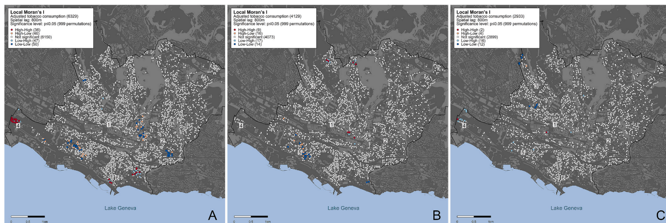
Fig. 2. Local Moran's I spatial clusters of tobacco consumption adjusted for individual and neighborhood socioeconomic, demographic, built, and natural factors at baseline (A), follow-up 1 (B), and follow-up 2 (C). Red dots correspond to individuals with high tobacco consumption surrounded by individuals with also high tobacco consumption (High-High). Blue dots correspond to individuals with low tobacco consumption surrounded by individuals with also low tobacco consumption (Low-Low). Pink dots correspond to individuals with high tobacco consumption surrounded by individuals with divergent low tobacco consumption (High-Low). Light blue dots correspond to individuals with low tobacco consumption surrounded by individuals with divergent high tobacco consumption (Low-High). White dots correspond to individuals without spatial dependence on tobacco consumption (random distribution). Landmarks (1–6) are shown to facilitate interpretation of the results.

with this behavior; a higher density of tobacco retailers (HR: 1.38; CI: 1.23, 1.55), neighborhood foreign population (HR: 1.46; CI: 1.32, 1.61), and recreational (HR: 2.30; CI: 1.84, 2.88), green (HR: 1.94; CI: 1.74, 2.17), and commercial & industrial land use areas (HR: 3.30; CI: 2.51, 4.34) increased the likelihood to move to these locations. There was not a statistically significant association of non-tobacco consumers changing their residence to areas located in clusters of low tobacco consumption (Table S3).