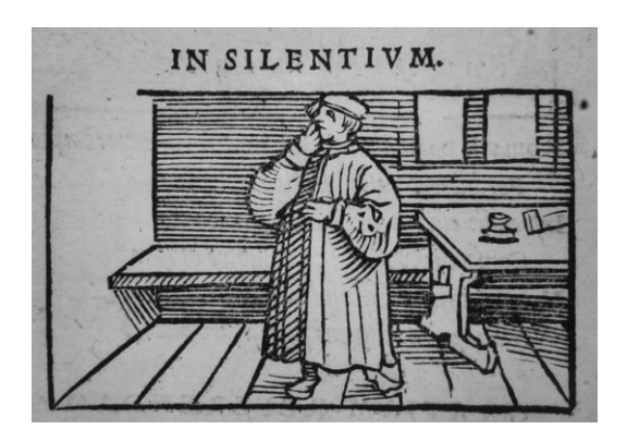
Figure 1: Emblem of Silence, from Andrea Alciato, Emblemata (1531). Courtesy of Glasgow University Library, Special Collections. SM18.

hide, to keep in silence, or from the knowledge of men," and reticentia as, "Silence, when one holdeth his peace, and uttereth not the thing that he should tell: a concealing or keeping of counsel."46 The iconography of silence carries similar suggestions of malice. In emblem books, for example, figures representing silence deployed the stock gesture of the Roman god of silence, Harpocrates: a finger placed on the lips, a sign we still use today (Figures 1 and 2). In the sixteenth and seventeenth centuries, however, this gesture was almost indecipherable from the sign for revenge: a finger placed between the teeth (Figure 3).<sup>47</sup> Is there any discernable difference between the gesture we see in G. P. Valeriano Bolzani's emblem "Meditation or Revenge" and, say, Andrea Alciato's emblem "Silentium" (Figures 3 and 4)? And why is the title of Bolzani's image "Meditation or Revenge," as if the two words, or ideas, were synonymous? The point of course is that from one perspective meditation—silent thought—and revenge are synonymous, or at least have the potential to be. The silent reflection of Alciato's More-like or Cuffe-like scholar may be innocent enough, but his reading could also