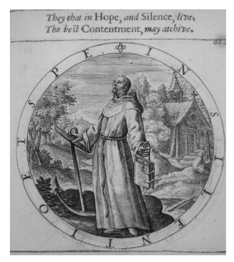
Figure 5: "In Silentio et Spe," from George Wither, A Collection of Emblemes (1635). C.70.h.5.

Truth spoken where untruth is more approved, Will but enrage the malice of thy foes.<sup>52</sup>