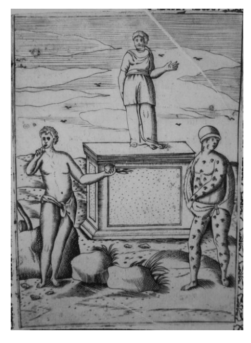
Figure 2: Personifications of Silence (Harpocrates on the left), from Vincenzo Cartari, Le Imagini degli Dei (1608). 1492.a.8.