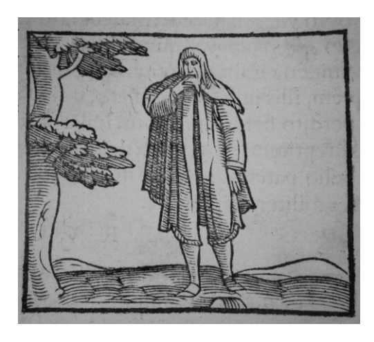
Figure 3: "Meditatio vel Ultio" (Meditation or Revenge), from Valeriano Bolzani, Hieroglyphica (1610). Courtesy of The British Library Board. C.76.h.1.

© 2012 The Author(s) English Literary Renaissance © 2012 English Literary Renaissance Inc.