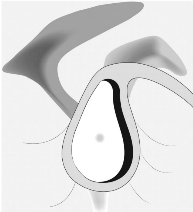
Figure 1. Representation of a type IV superior labral anterior to posterior (SLAP) lesion. There is a superior labral detachment in addition to the anteroinferior Bankart lesion.

86.4% to 90.9% and specificity from 50.0% to 93.3%. 1,8,9 The treatment of SLAP lesions is also controversial, with several options available: One can debride the lesion, perform a labral repair, or even perform a tenotomy or tenodesis of the long head of the biceps tendon. Additionally, how to go about repairing a SLAP lesion is controversial: it can be repaired either before or after the Bankart lesion. Recently, however, a retrospective review showed no difference in functional outcome at a minimum of 2-year follow-up between these 2 different repair methodologies. 10