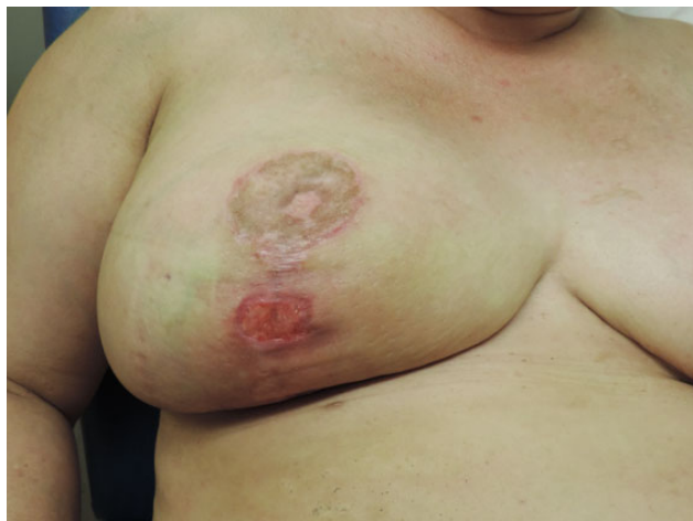
Figure 2: Clinical status after US-guided drainage and 2 weeks IV antibiotic therapy.