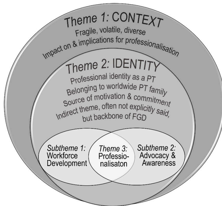
Figure 1. Themes. The main themes are illustrated in the circles. The themes ‘Context’ and ‘Professional Identity’ frame, define and influence the sector-specific theme ‘Professionalisation’, which comprises the sub-themes ‘Workforce Development’ and ‘Advocacy and Awareness Raising’. Figure 2 zooms further into these two subthemes. PT = physiotherapist/physiotherapy; FGD = focus group discussions.