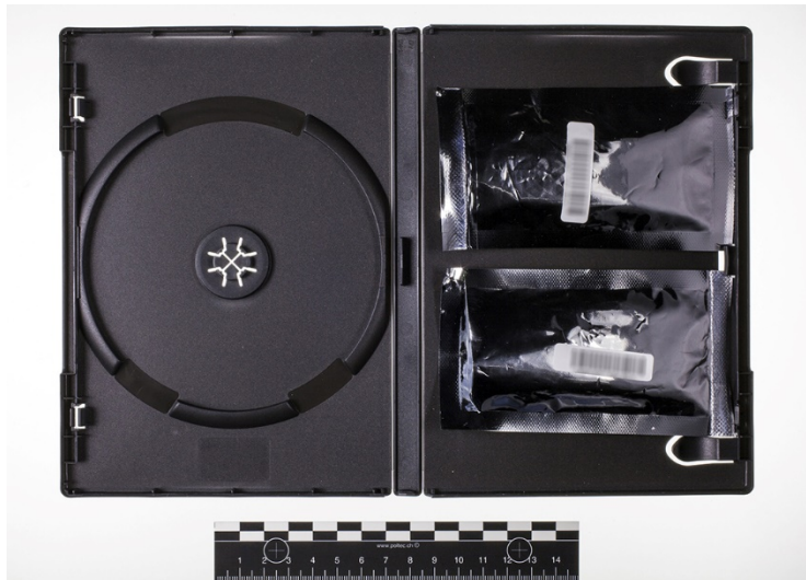
Figure 8. DVD keep case containing cocaine and MDMA pills in two different bags