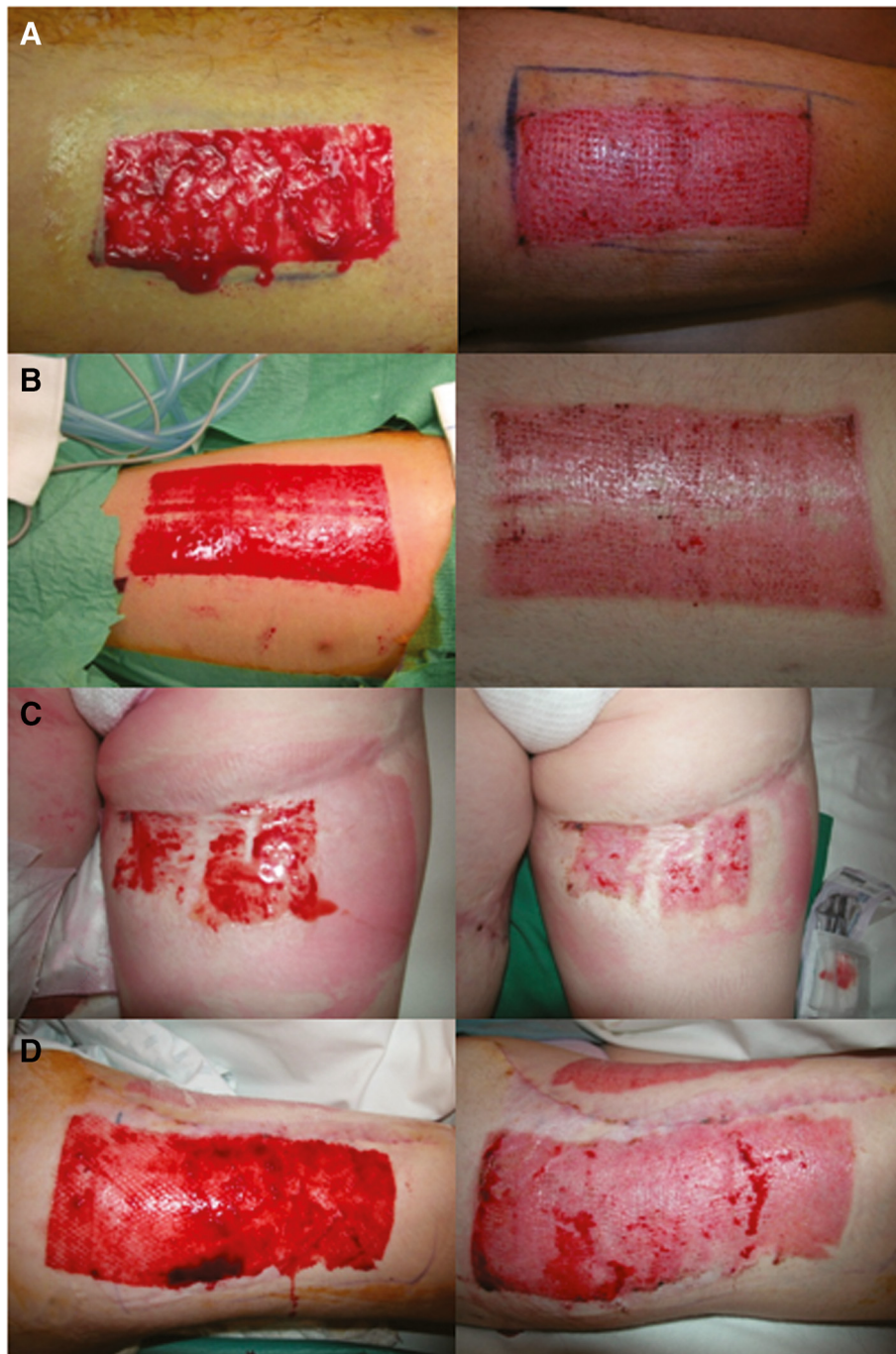
Figure 2 Pictures demonstrate greater amount of epithelialization when treated with platelet concentrate or keratinocytes suspended in a platelet concentrate. (A) and (B) show treatment with PC at operation time (left panel) and seven days later (right panel). (C) and (D) show treatment with PC + K at operation time (left panel) and five days later (right panel).

however becomes consequential relative to the wound surface to be covered [9,33,34].