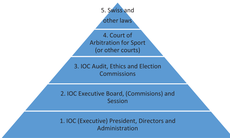
Figure 3. Pérez's model applied to the IOC.

The IOC falls mostly under the jurisdiction of Swiss law because, like many other international sport organizations, it is based in Switzerland and subject to articles 60–79 of the Swiss civil code (for Swiss nonprofit associations). It is also subject to other Swiss laws and to the Court of Arbitration for Sport (set up under chapter 12 of the Swiss federal law on international private law), which is recognized by all the IFs of Olympic sports as the supreme body for settling sport related disputes. Olympic sports organizations accept the need to collaborate with national governments, as long as they retain their autonomy. The 'price' they pay for this autonomy is an obligation to implement 'good governance' (see, for example, point 7 of the BUPs: 'Harmonious relations with governments while preserving autonomy', IOC 2008).