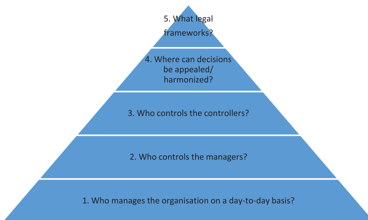
Figure 2. The five questions associated with Pérez's five levels of governance.

The first three levels of Pérez's model depend mostly on internal structures and statutes set up by the organization in question. In contrast, the top two levels (4 and 5) require government supervision via national or international law.