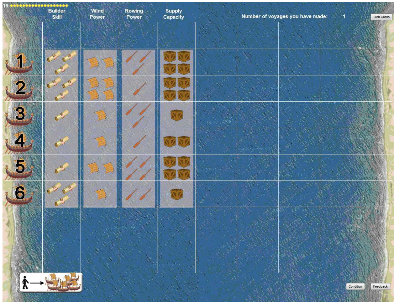
Figure 1: Screenshot of the task used in the new experiment.