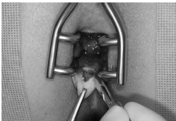
Figure 1 Surgical excision of fissure edges and sentinel skin tag. Triangle shape of excision facilitates wound drainage. Résection chirurgicale des berges de la fissure avec sa marisque sentinelle. La forme triangulaire de l'excision favorise le drainage de la plaie.

ling rate (95% versus 65%) and lower recurrence rate (8% versus 20%) than botox and there were no differences in complications and incontinence rates.