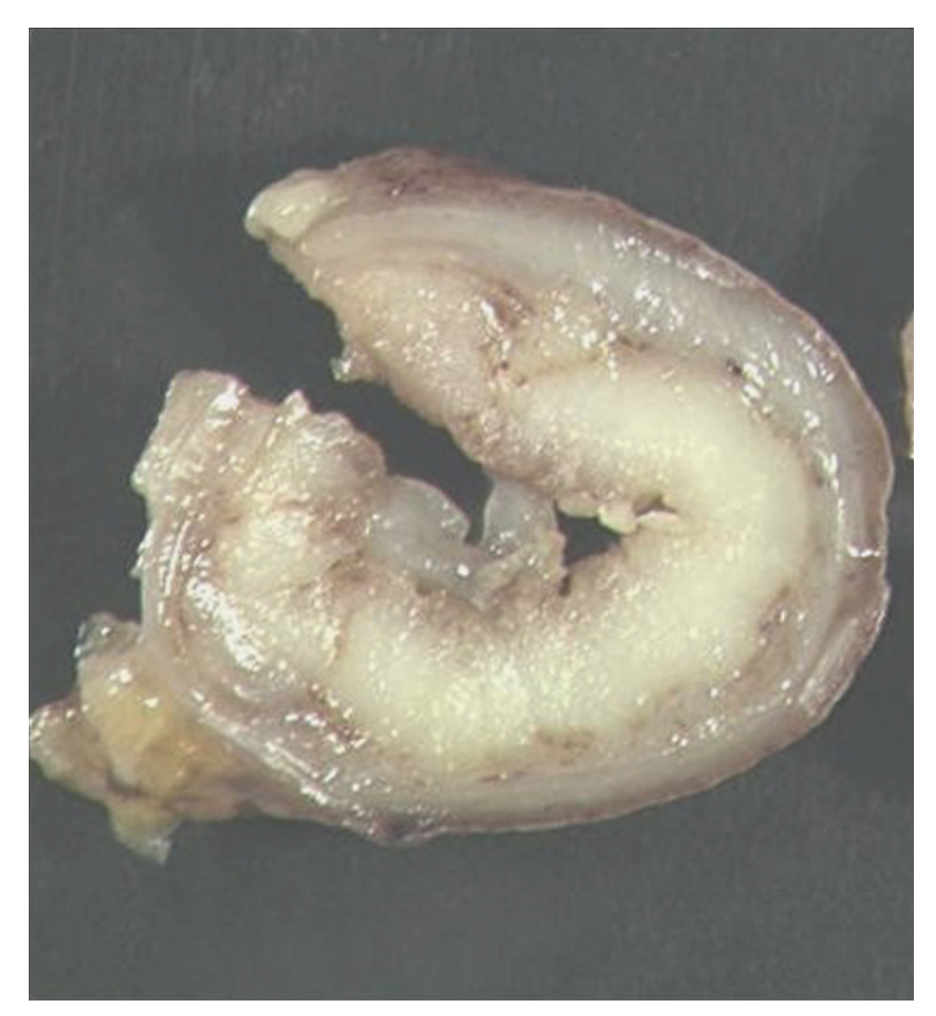
Fig 2. Surgical specimen.