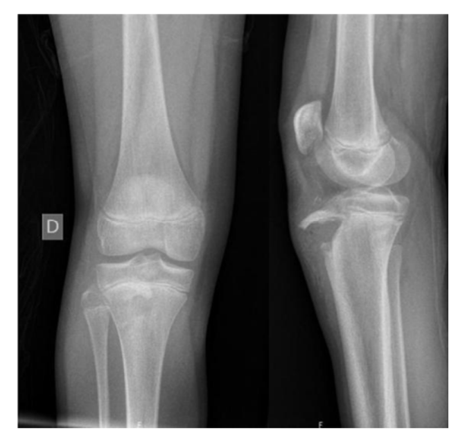
Figure 1. Initial AP and lateral X-rays of the right knee of our patient. The tibial tubercle fracture is evident in the lateral views, however the patellar fracture is barely visible.

Radiographs of the knee (Figure 1) showed an avulsion fracture from the tibial tuberosity with the bony component drawn proximally. The tibial tubercle avulsion was described as being a Watson-Jones type 2 [4] (Ogden IIB [5]) (Table 1), while the distal patellar lesion was characterized as a sleeve-like fracture.