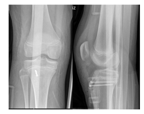
Figure 2. Immediate postoperative AP and lateral X-ray. Surgical fixation with cannulated screws of the tibial tubercle avulsion fracture is evident.

Anatomic reduction was achieved under direct visualization and fixation was assured by 2 cannulated screws of 4.0 mm with a washer (Asnis III, Stryker, Selzach, Switzerland) (Figure 2). The patellar fracture did not involve the distal pole in its entirety, consequently we let it heal without any surgical interference, with good results.