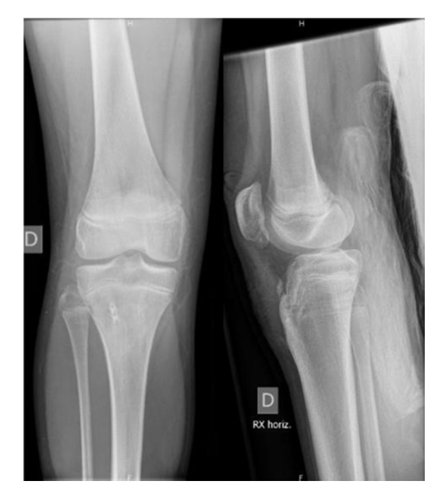
Figure 4. AP and lateral X-rays after the hardware removal showing consolidation of the fractures.

Figure 3. KOOS-Child score progression at 6 weeks and 12 weeks.