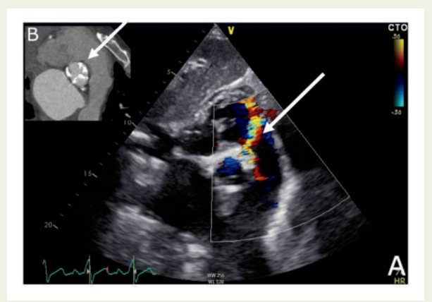
Figure I (A) Transthoracic colour Doppler echocardiography, short-axis view of the aorta—right ventricular fistula in telediastole (arrow). (B) Pre-transcatheter aortic valve implantation computed tomography scan (in the same orientation of the main image) showing calcifications in the base of the right coronary leaflet of the stenotic aortic valve

The preoperative transthoracic echocardiography confirmed a degenerative and calcified mitral valve with a posterior jet of severe regurgitation of mixed aetiology mainly due to tethering of P2