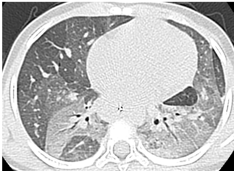
Figure 1 Chest computerized tomography scan showing diffuse ground-glass opacities with air-bronchograms in the upper lobes and the left lower lobe.

Desquamative interstitial pneumonia (DIP) is the most frequently described histologic diagnosis amongst